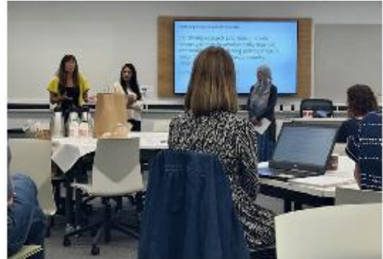
University of Sheffield Cultural Research Talk