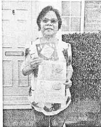
Member received new year card and recipes