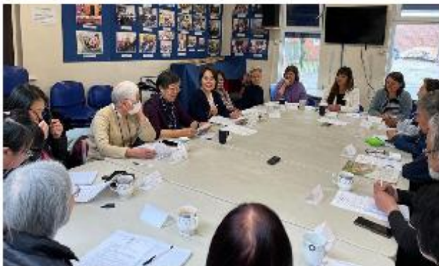
Brain Health Workshop