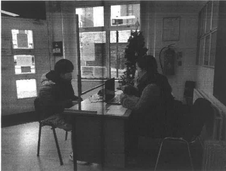
Member received health information and support provided by the Centre staff

Achievements and performance (continued) Photos Gallery