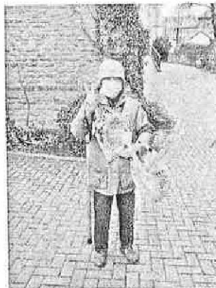
Member received Activity Pack