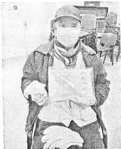
Member received Calligraphy set at the centre