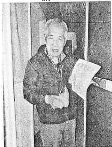
Member received Calligraphy set at home