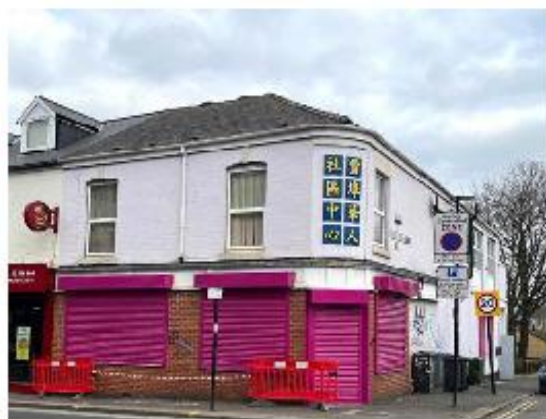
Newly refurbished Community Centre