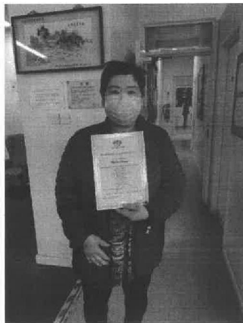
Member received the Food & Hygiene Certificate after passing the exam.