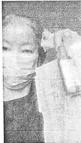
Member received Calligraphy set