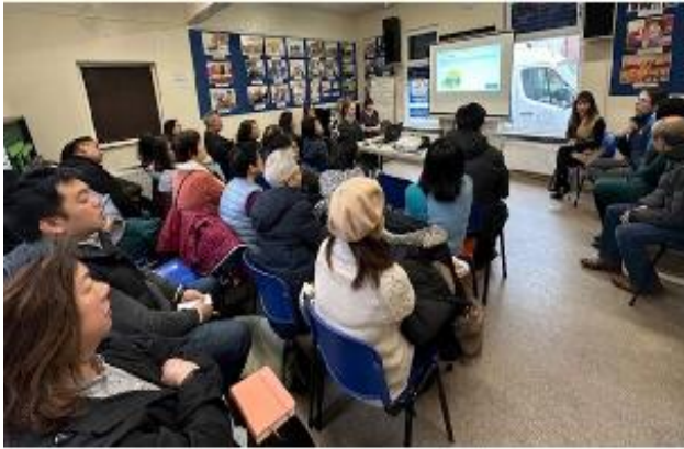
CognoSpeak AI Research Project