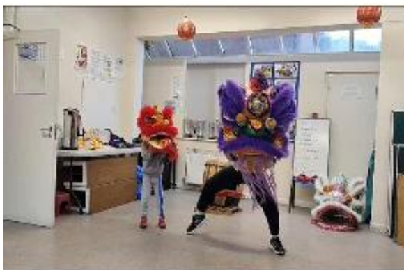
Lion Dance Lessons