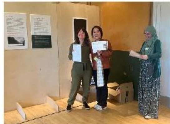
Photovoice Project Exhibition