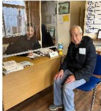
Health and Social Support