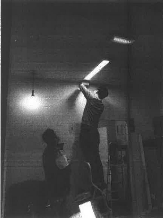
Volunteers donated the new LED lightings to the Centre and helped to install all the lightings for the Centre in Dec. 2021