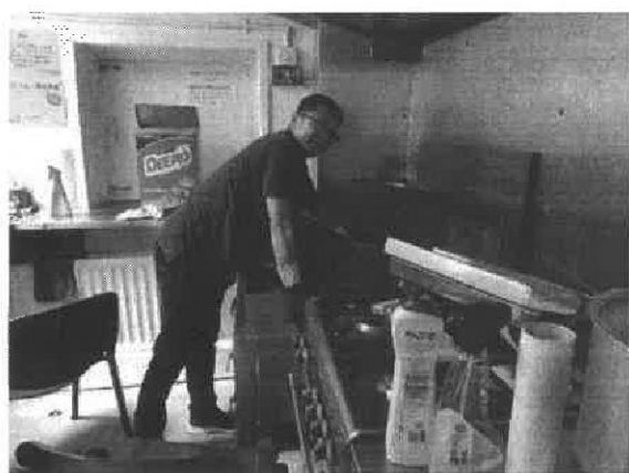
Volunteer helped to do the deep cleaning of the Centre's kitchen on 17 th August 2021

All pictures credit source: Taken by Sheffield Chinese Community Centre