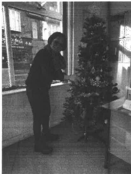
Volunteer decorated the Christmas Tree in Dec. 2021

Lord Mayor's Christmas Thank You Event for Sheffield's Lunch Club Volunteers at the Sheffield Town Hall on 10 th December 2021 and we received the Prize for winning the Henderson's Choice Award from the Lord Mayor