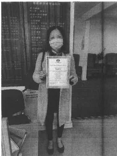
Member received the Food & Hygiene Certificate after passing the exam.