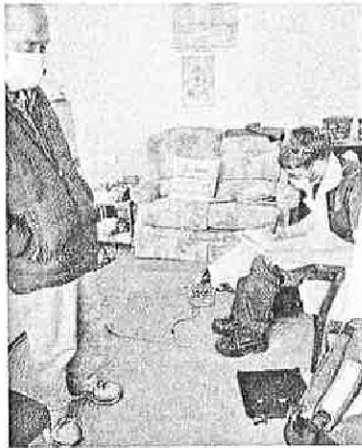
Language support to members