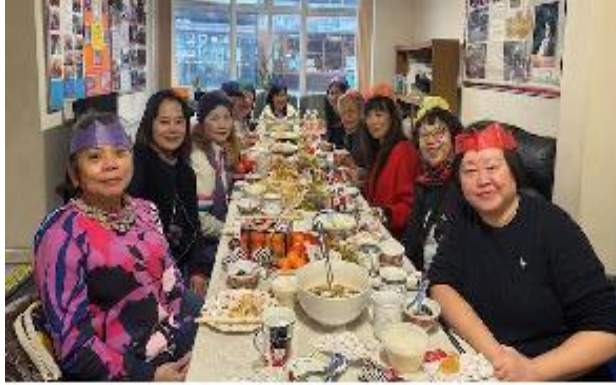
Weekly Happy Tea-Time

Trustees' annual report (continued) for the year ended 31 March 2025