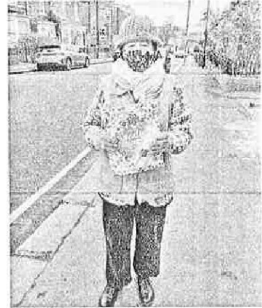
Member received colouring book and other items