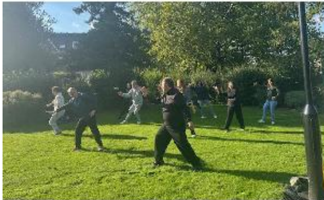
Tai Chi in the Park