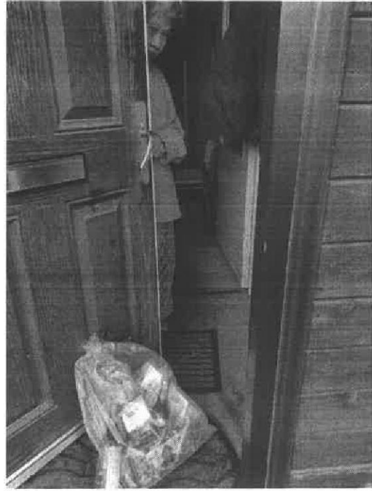
Member received gifts for Chinese New Year 2022