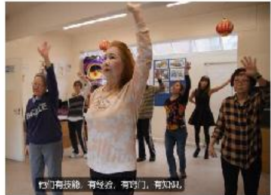
Tai Chi Dance