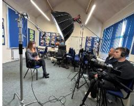
Filming interview on culture