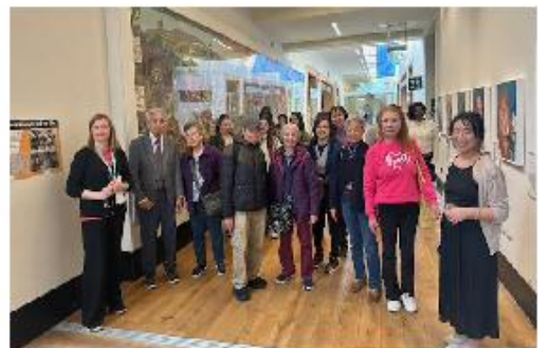
Weston Park Museum Visit