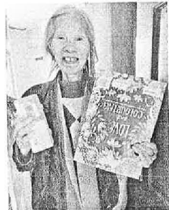
Member received Activity Pack