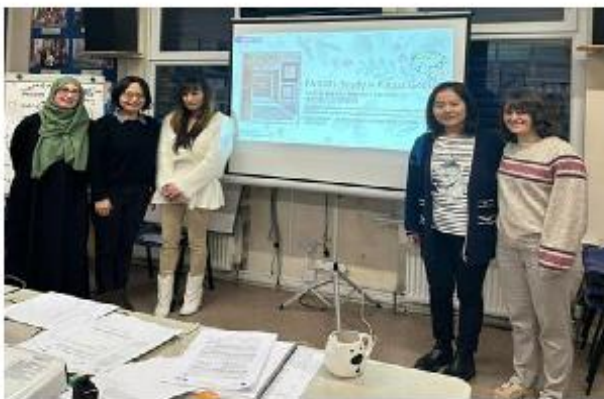
Photovoice Research Project