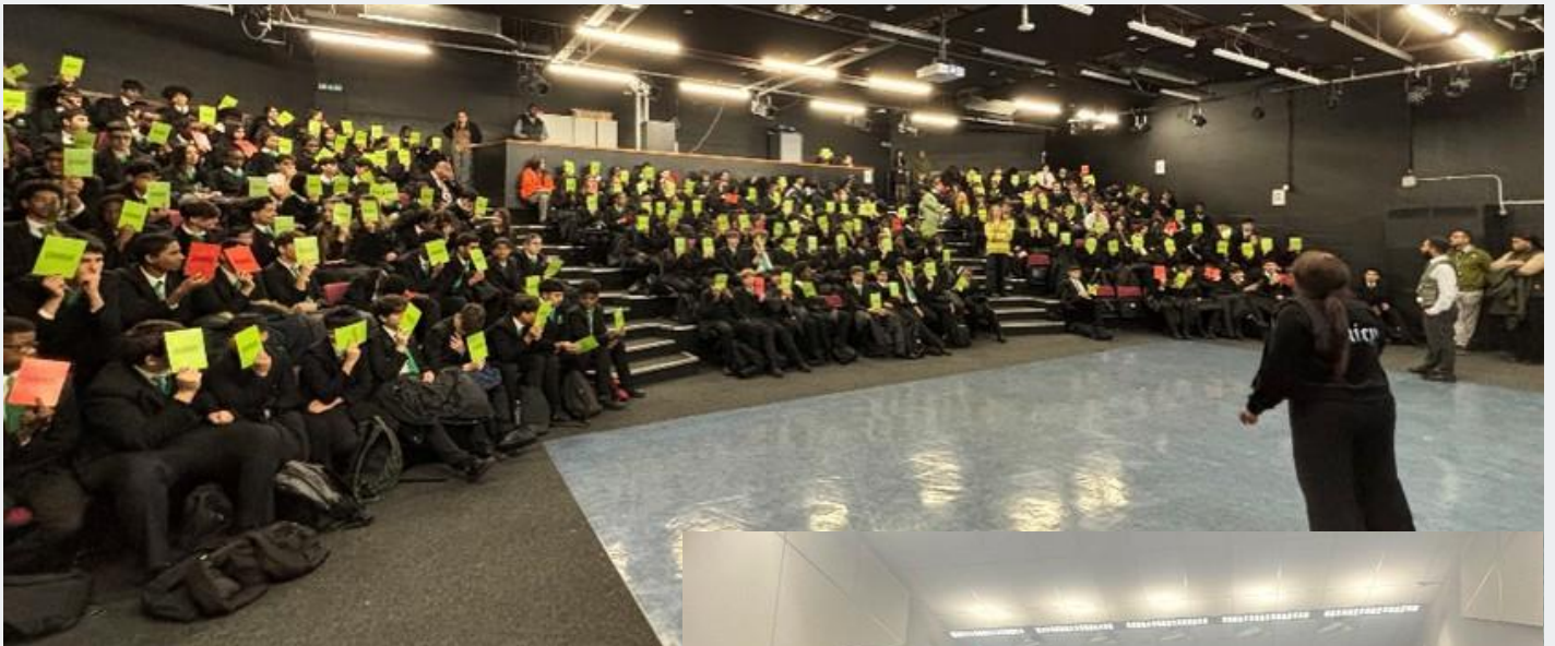
Q&A session during an assembly about Godwin's story