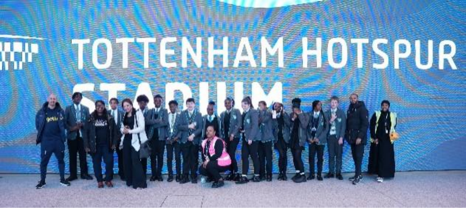
The Foundation’s Annual Memorial Tournament

Promoting anti-violence messages in partnership with the Tottenham Hotspur Foundation