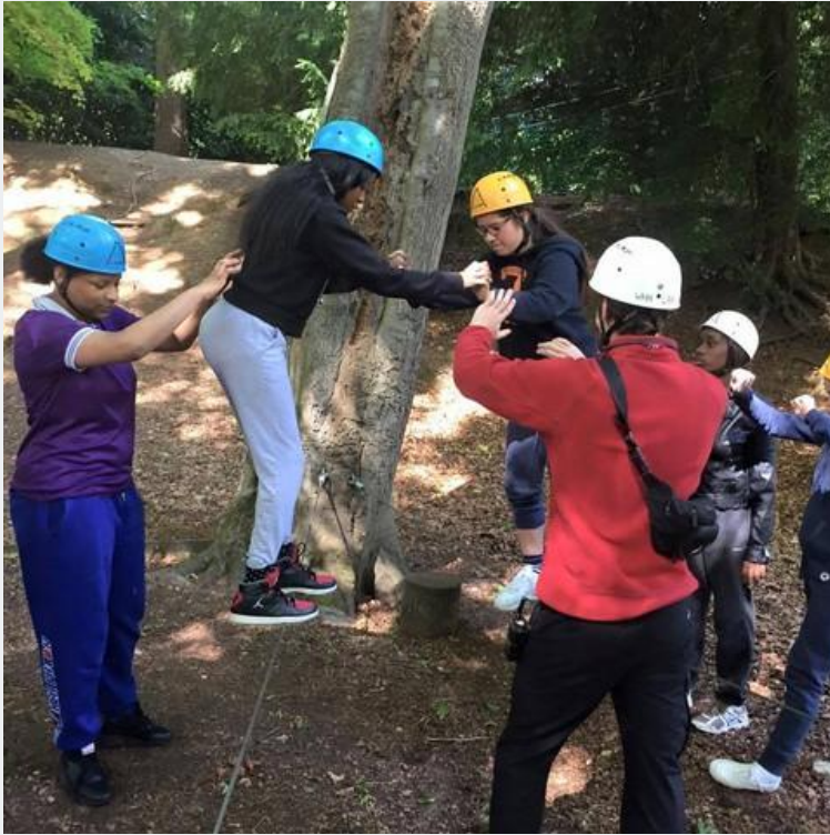
Empowering girls programme