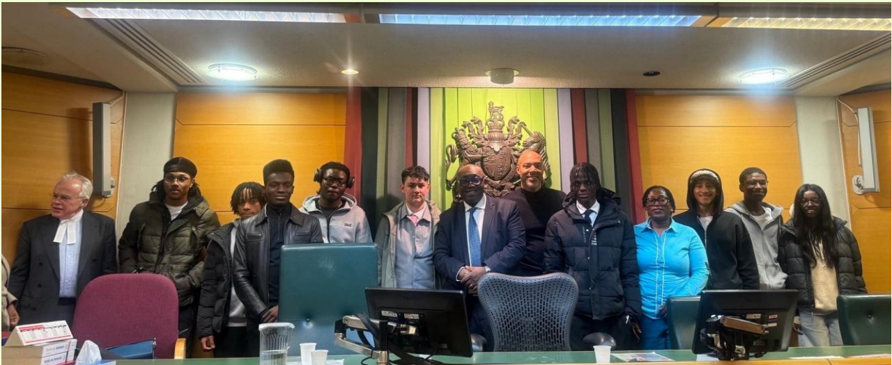
Wood Green Court: Teaching young people about the criminal justice system