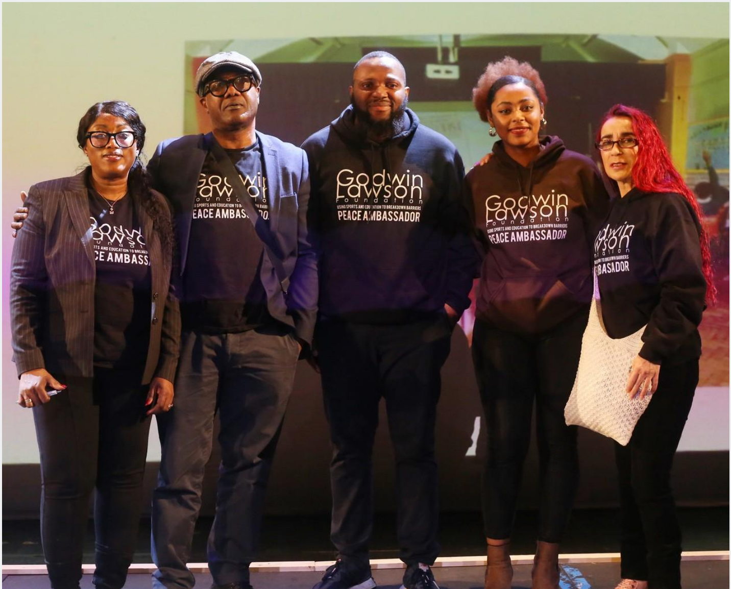
GLF Peace Ambassador volunteers