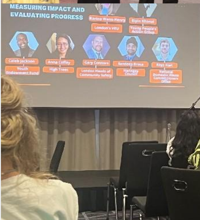
VRU (Violence Reduction Unit) Conference