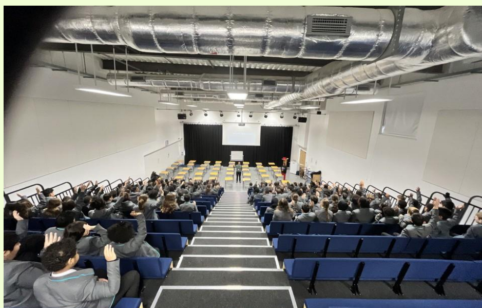
Home Cooked Project