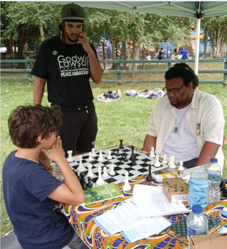
Weekly chess matches as part of our Checkmate with Purpose programme