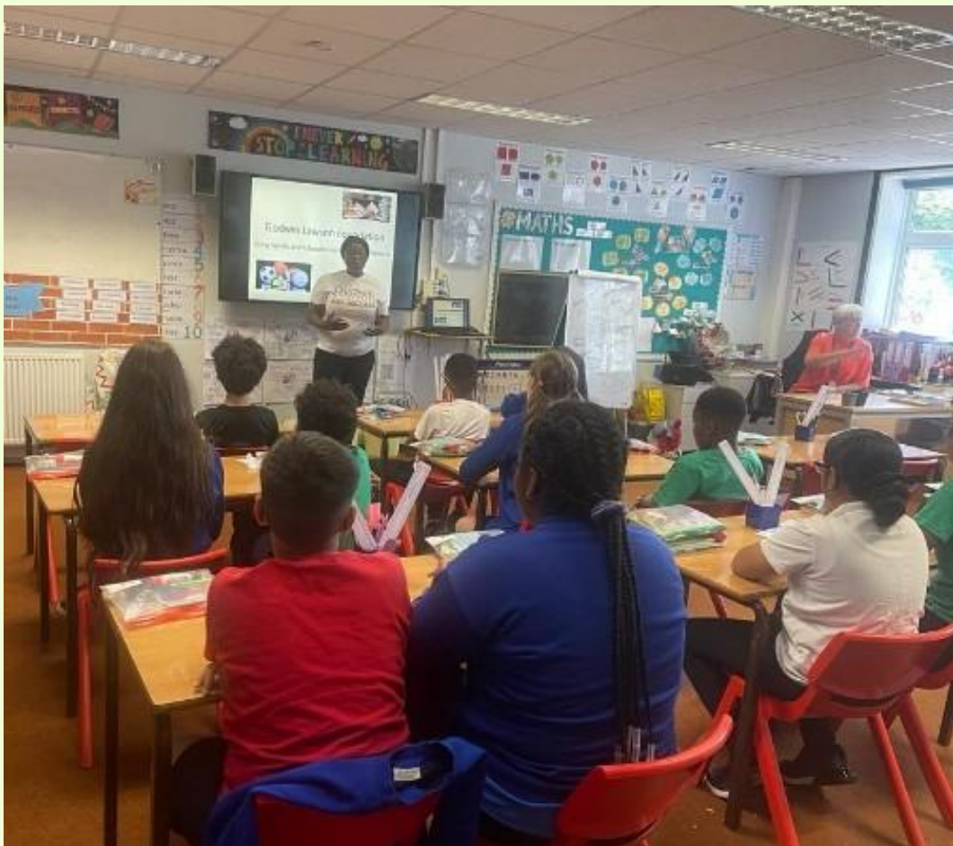
Workshop at Ferry Lane Primary School