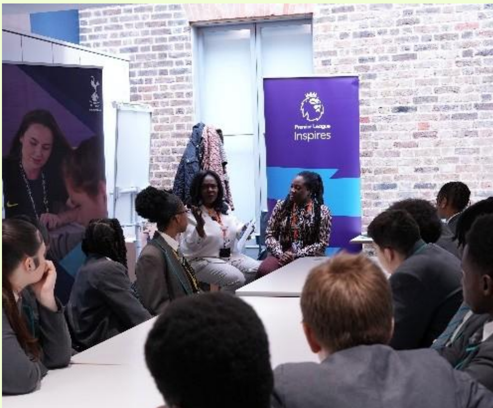
Career workshop with Arriva

Our mission is clear: Breaking barriers. Building futures