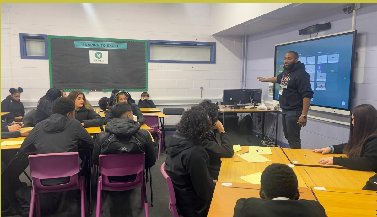
Workshop at local school