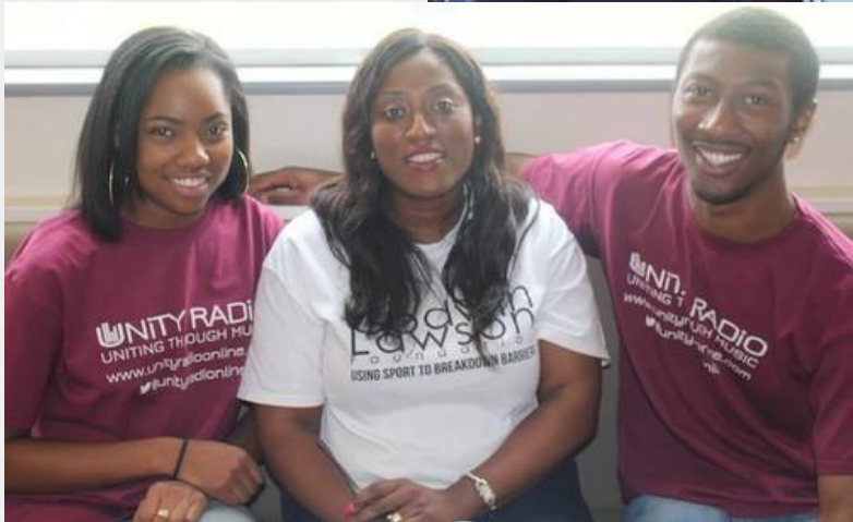
Unity Radio: using music to breakdown barriers