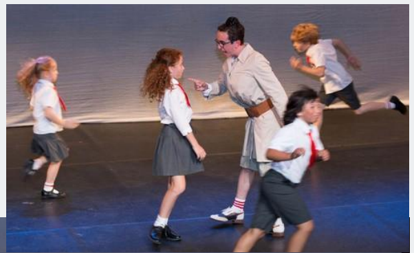
Stage production events