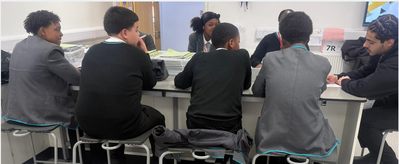
Early intervention workshops where pupils pledge not to carry knives