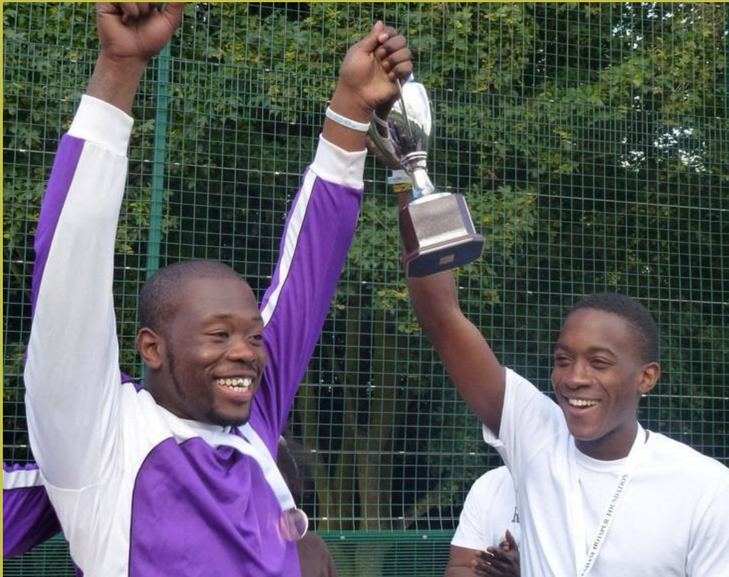
Uniting young people and promoting anti-violence messages through sport

2024-25 has been a year of growth, resilience, and greater impact. GLF has expanded its reach, supported young people and families, and shaped the debate on youth safety.