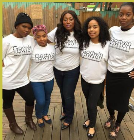
Peace Ambassadors volunteers