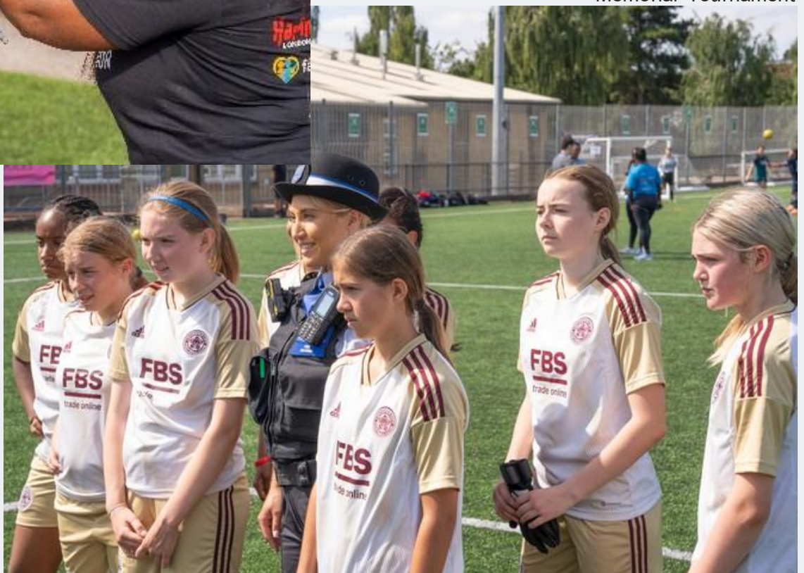
Working with The Met Police at the Annual Memorial Tournament