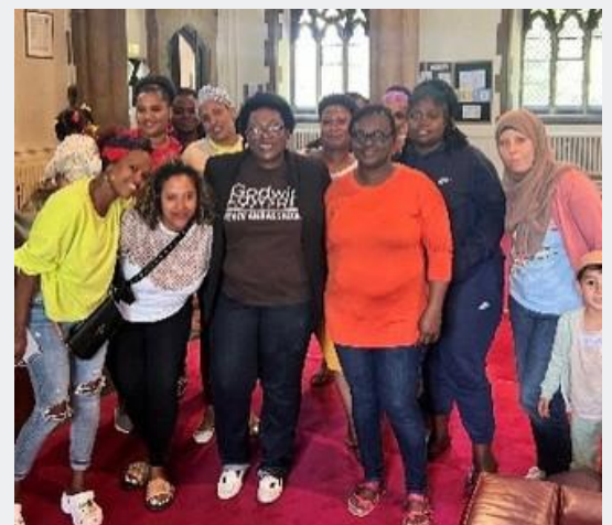
Supporting parents and carers through the Family Hub projects and the Parent Champions Carers Network