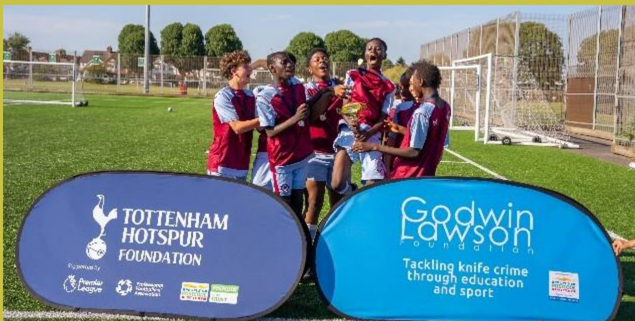
Champions of 2025 in collaboration with the Tottenham Hotspur Foundation