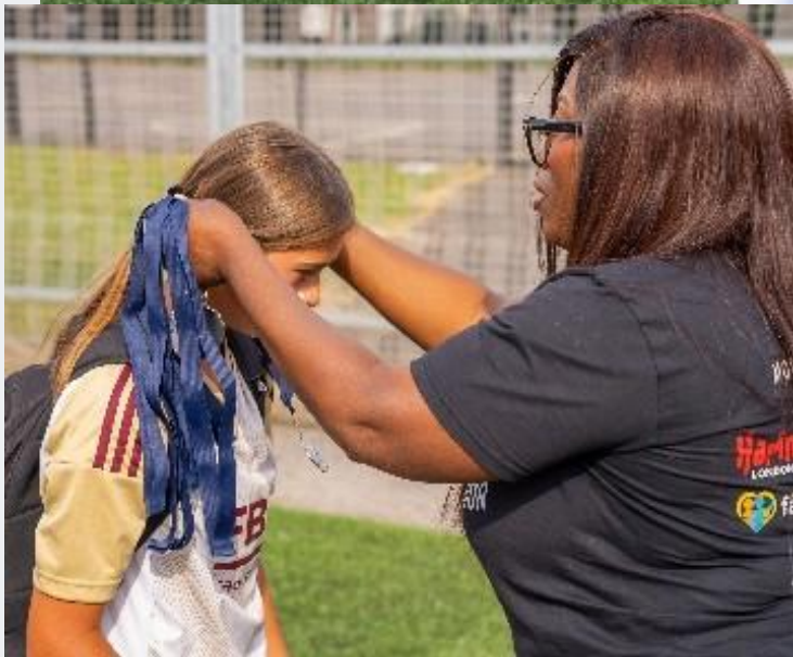
Handing out medals