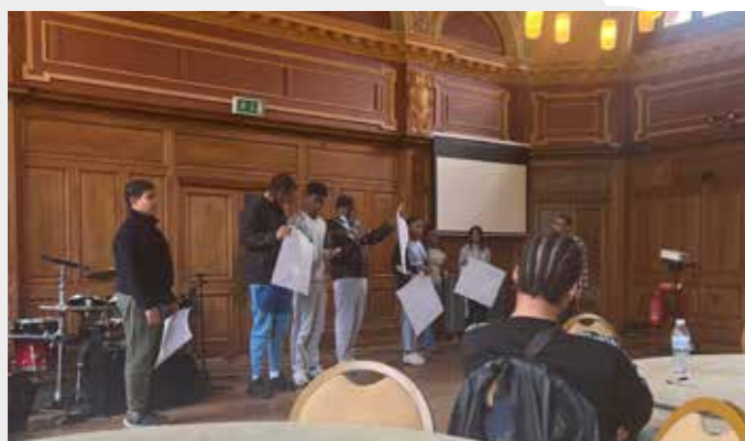
Risley Primary School talk