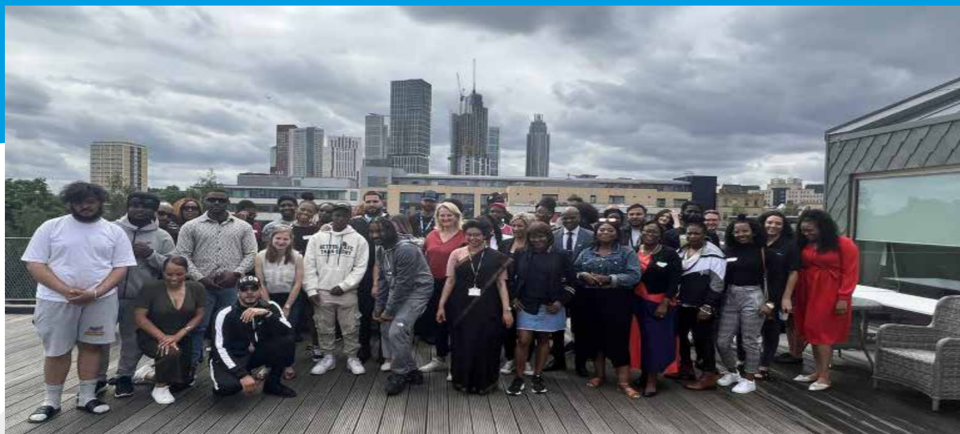
Haringey Youth Advisory