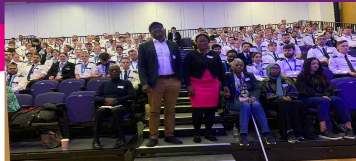
St Anne's Catholic School talk