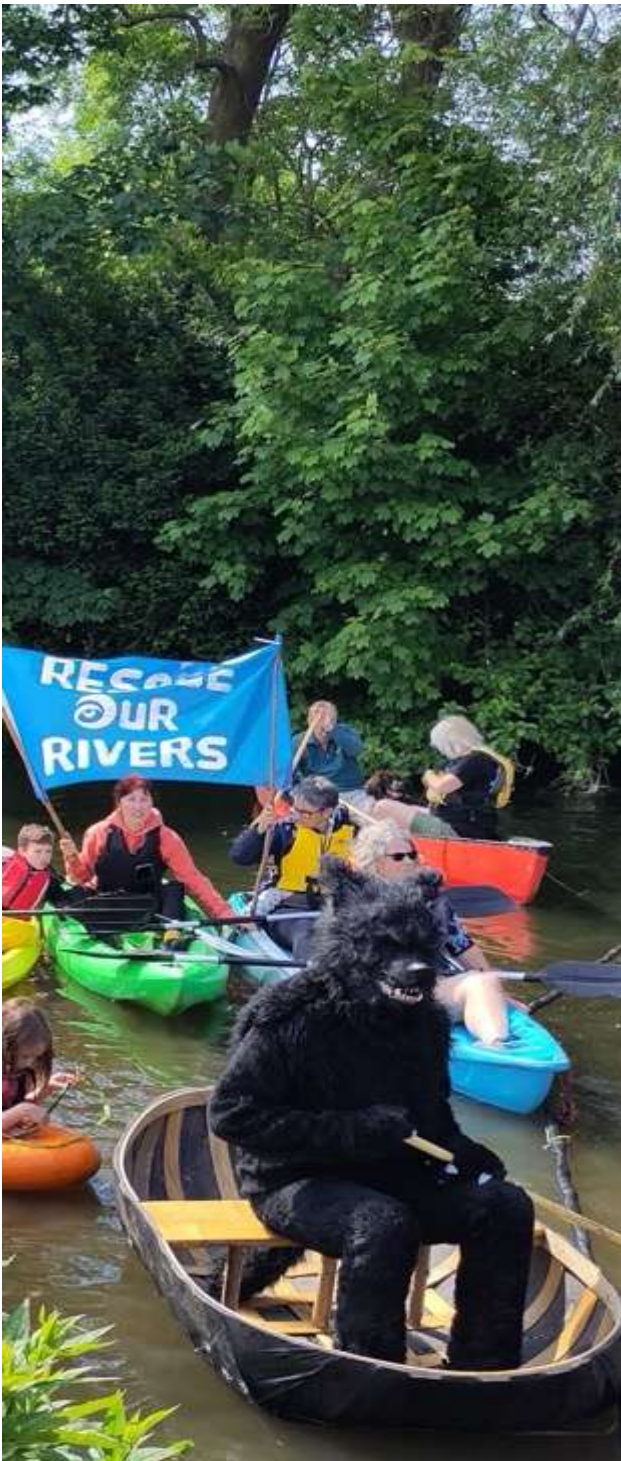
Day of action on the River Waveney through the Bathing Water project

“The project was a ‘cracker’, a true partnership approach with a diverse group of stakeholders”. Feedback from funders Essex & Suffolk Water on our River Access project