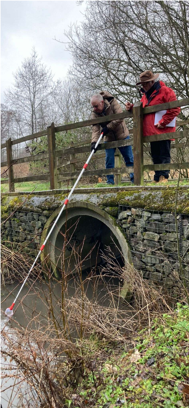
Water sampling for bacteria from sewage and agricultural sources