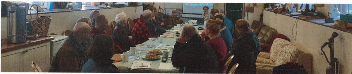
Waveney Farm Cluster event – skilling up both RWT staff and farmers/landowners

Areas for improvement: as with all organisations, there are areas that we could do better on. These have been identified as coordinating a better support network for our existing volunteers, skilling up our staff on delivery of larger river restoration projects, financial management and increasing our media reach. Activities planned for 2023/24 include the recruitment of a member of staff to coordinate volunteers through our community project, accessing relevant training through the national Rivers Trust (CDM, H&S, contracts for construction work and media training), building relationships with local media outlets and employing the services of a specialist charity accountant.