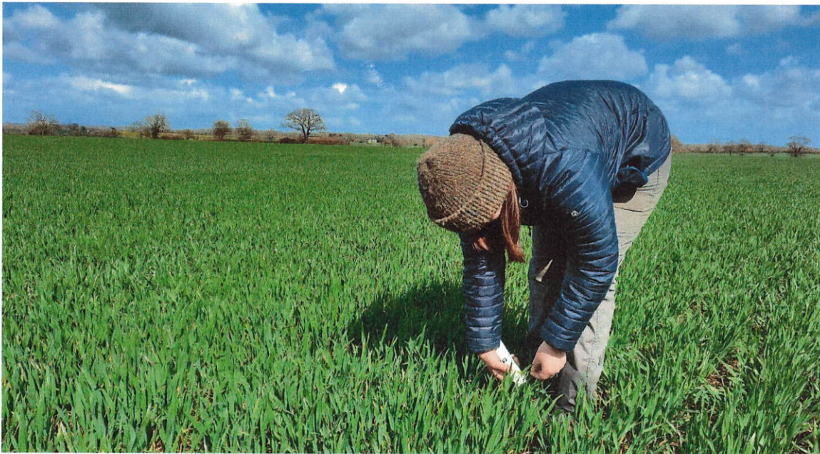
Crop testing as part of our Nutrient Use Efficiency Project