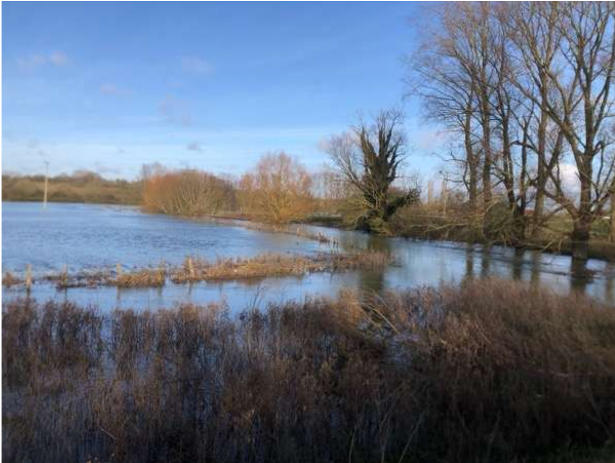
Flooded fields in the natural floodplains of the River Waveney near Harleston