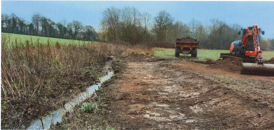
Natural Flood Management Pilot – reconnecting the river to its floodplain