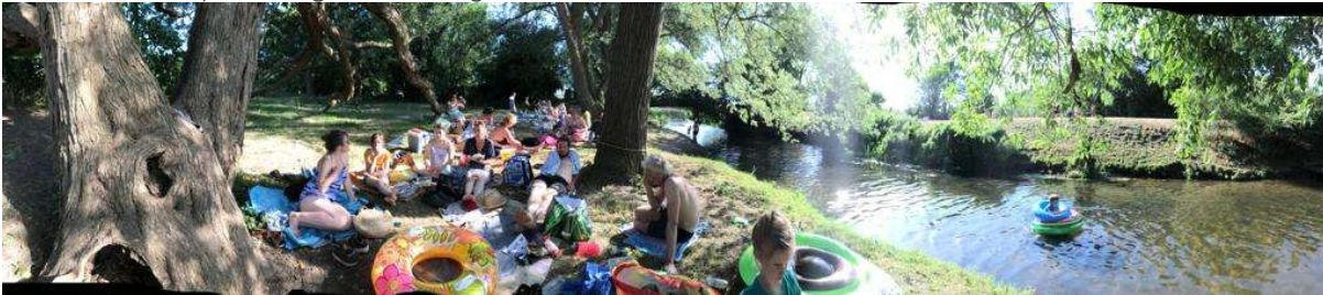
A summers day on the River Waveney at Homersfield Bridge, an RWT managed riverside site

This report highlights the work that the Trust's staff and volunteers have delivered over the past year. Much effort has been invested by all and great thanks go to all that have contributed to our success.