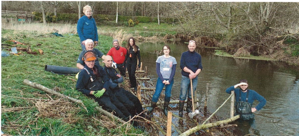
Volunteers, RWT staff and Wild Trout Foundation working on our Canoe Access & Biodiversity Project

This report highlights the work that the Trusts staff and volunteers have delivered over the past year. Much effort has been invested by all and great thanks go to all that have contributed to our success.