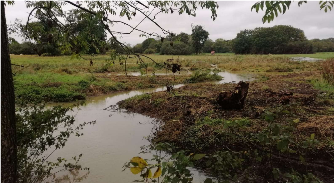
Natural Flood Management work in Gissing – reinstatement of an old paleo-channel

Recruitment of trustees follows the Trustee Recruitment Policy as adopted in 2013 and reviewed annually. Open advertising is used across a variety of platforms and applicants must apply with a cover letter and CV. Applicants are sent a comprehensive trustee recruitment pack to read before taking the application any further. A nominated person from the board will then arrange to speak to the applicant who will be invited to attend a board meeting as an observer. Following this, if both the board and the applicant wish to proceed, the applicant will be invited to join the board at which point they will be required to register with the Charity Commission via the Company Secretary.