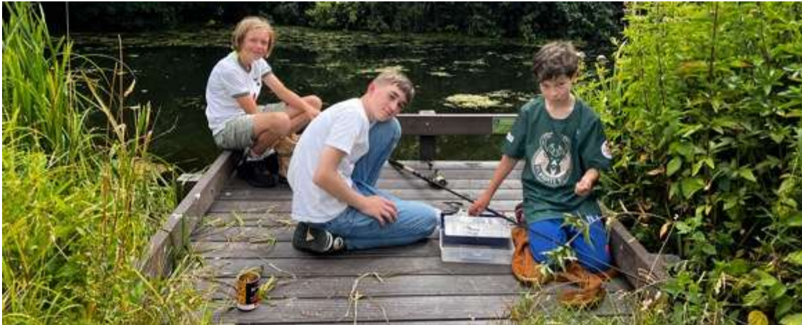
Young anglers on the River Waveney at Falcon Meadow in Bungay.