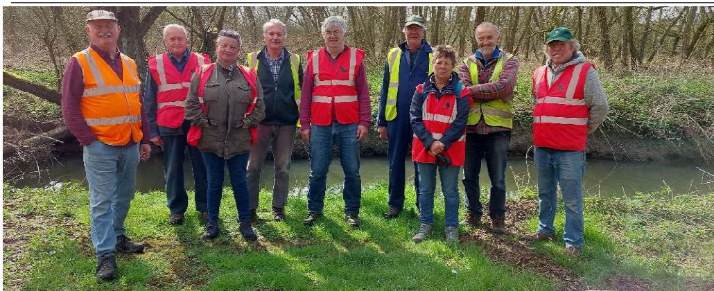
Volunteer group in Diss – supporting volunteers well is essential for success.