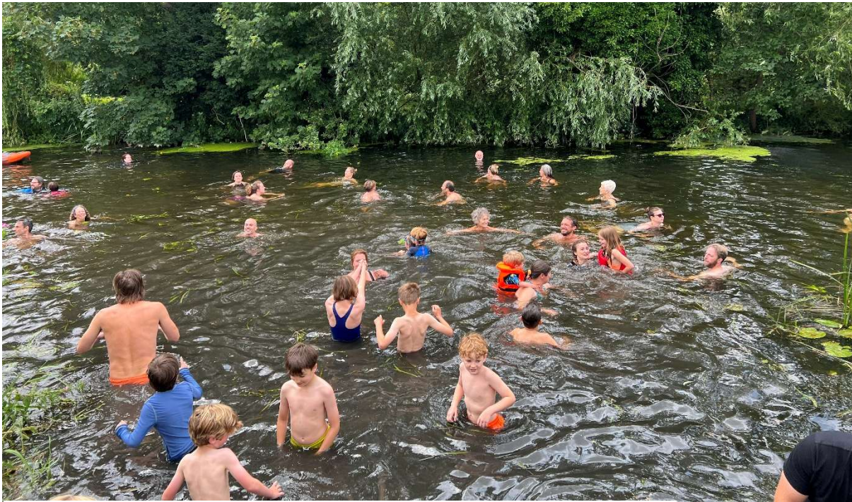
Bathing Water Blitz event on the River Waveney in Bungay