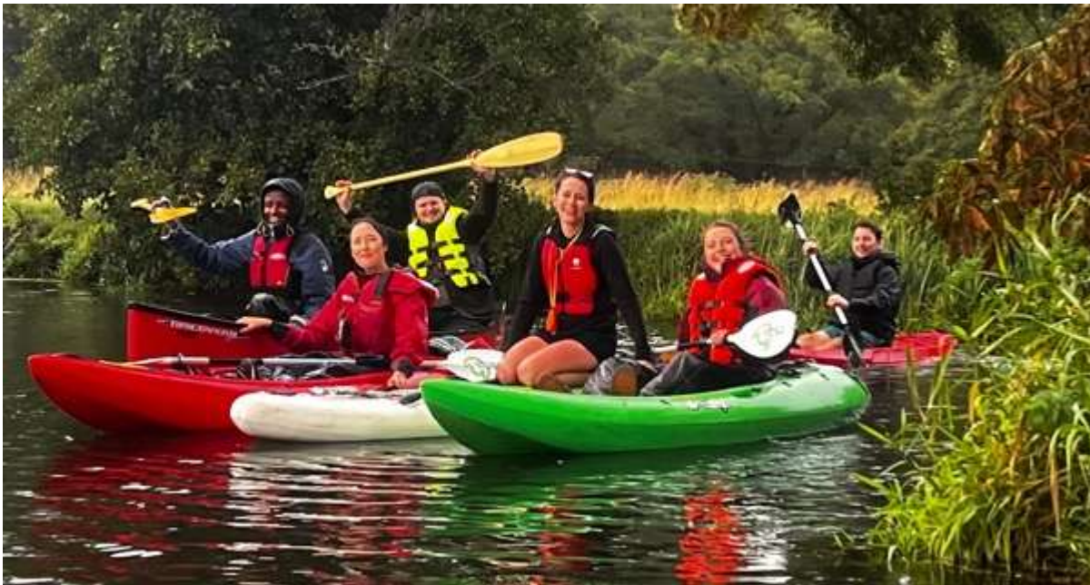
River Waveney Trust staff team enjoying an afternoon on the river