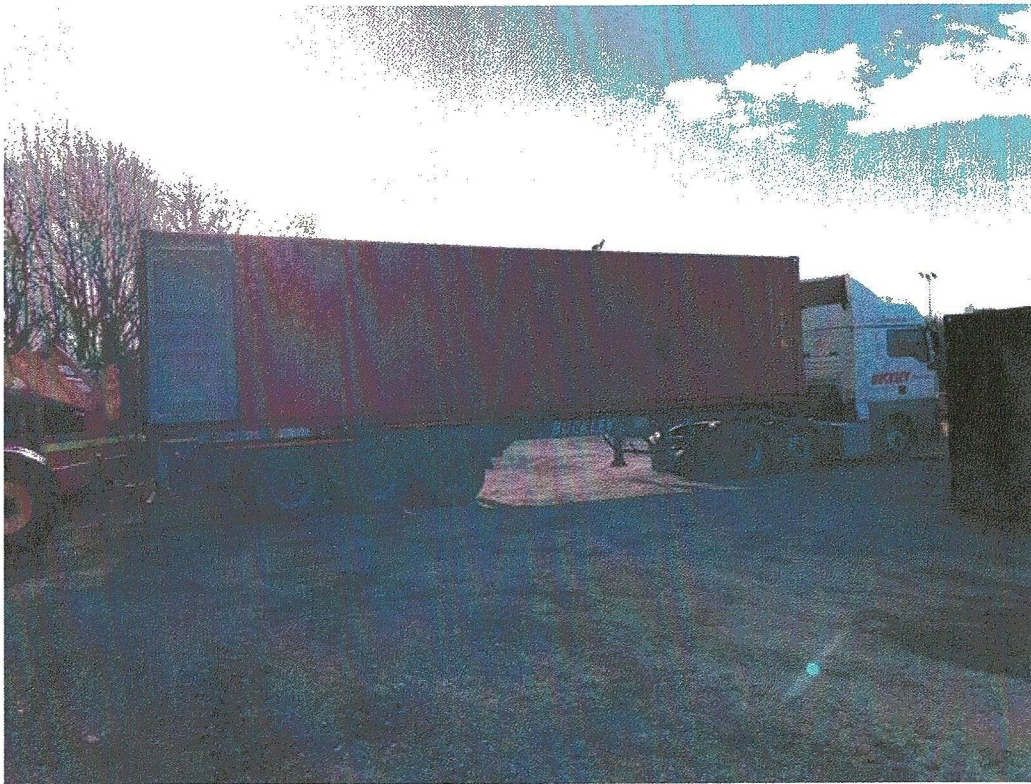
40ft container of donated PPE and equipment loaded in Lancashire setting off on its journey to the Philippines March 2021

A number of fire services within the Philippines have received donations throughout the years. In March 2021 we shipped a 40ft container of PPE and equipment to the country.