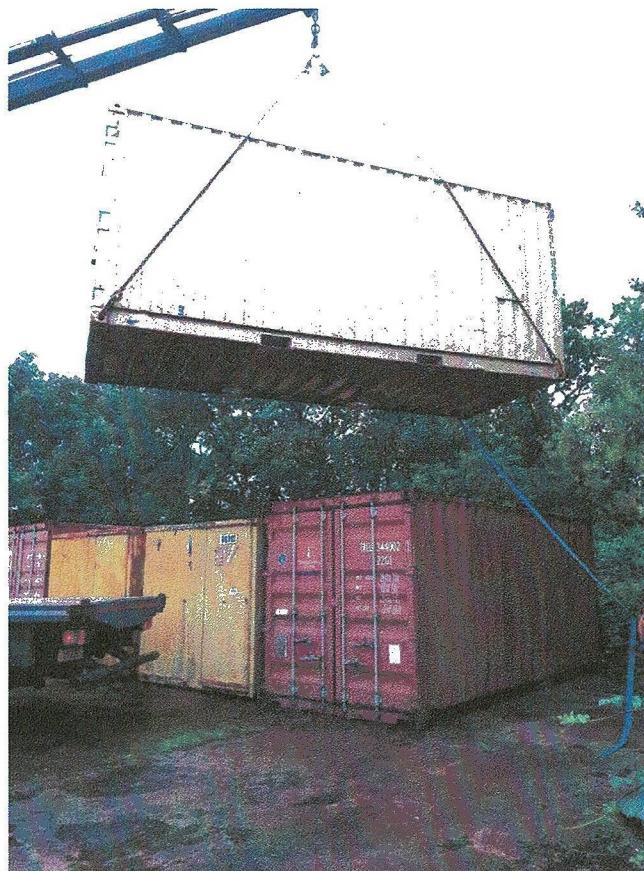
20ft container being delivered to our stores in Lancashire

Operation Florian has five stores in throughout the UK to store donated equipment ready for shipping to locations throughout the world. Due to the success in securing donations we had to purchase another 20ft container for storage and rack it out.