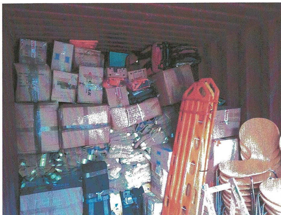
Container of vital donated PPE and equipment – Destination Harare Zimbabwe

However due to the easing of restrictions we were able to load and ship a 20ft container of PPE and equipment in September 2021 to Harare Zimbabwe.