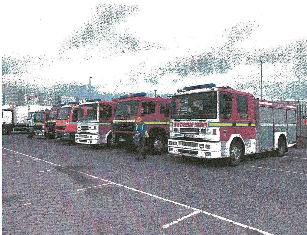
Proposed 6 fire appliances to Zimbabwe in late 2021

Planning is taking place to ship 6 fire appliances to Zimbabwe. These vehicles have been donated by Cleveland Fire Brigade, GMC Fire and Rescue Service, South Wales Fire and Rescue Service and Lancashire Fire and Rescue Service.