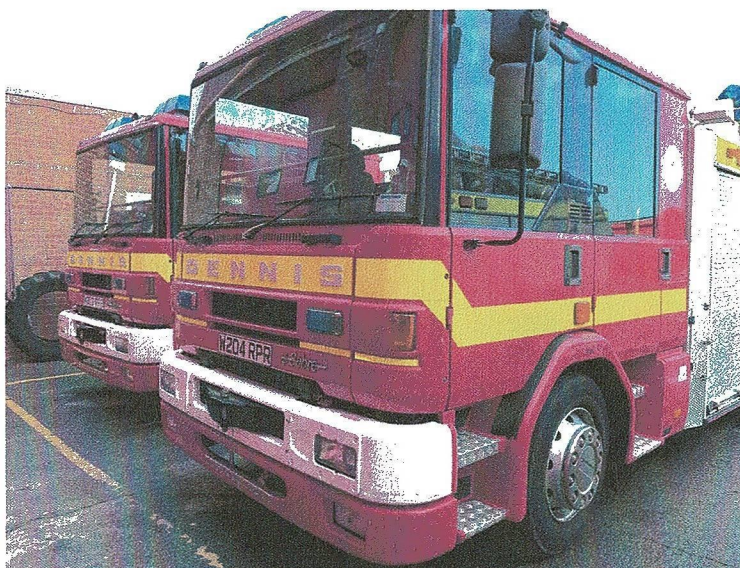
Two of the three Dennis vehicles destined for Macedonia in late 2021