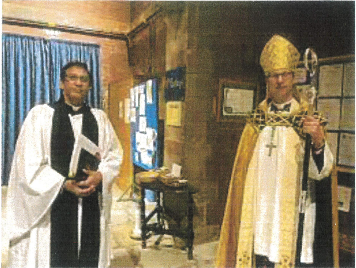
Photograph taken at the Installation 20 th January 2021