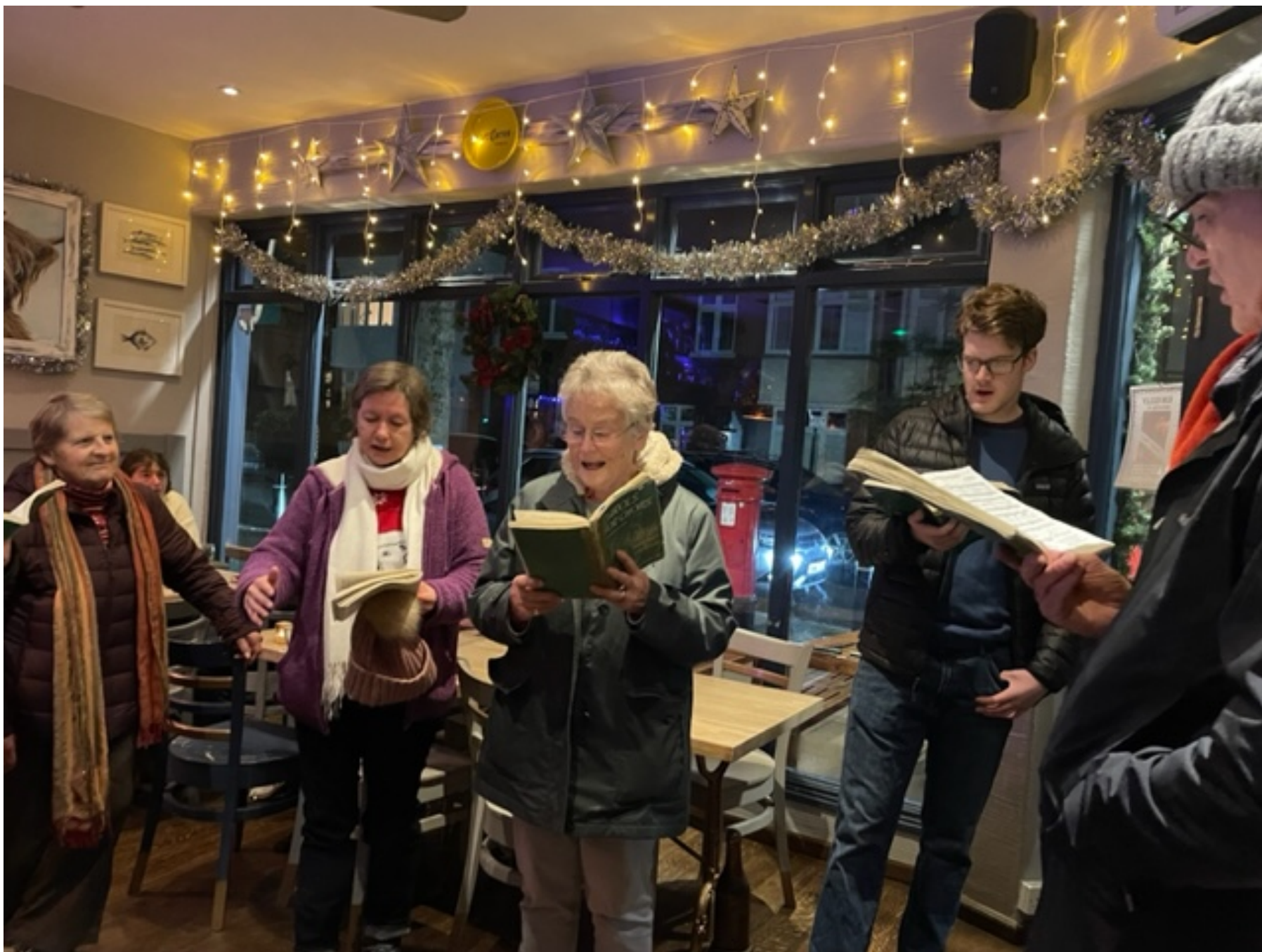
St Michael's Choir singing Christmas carols in The Copper Cow, December 2022

St Michael's is a broad friendly church with a lively vicar and a modern outlook, driven by traditional Christian values.