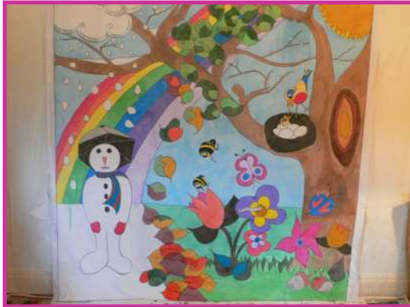
One of the many original backdrops created for storytelling sessions