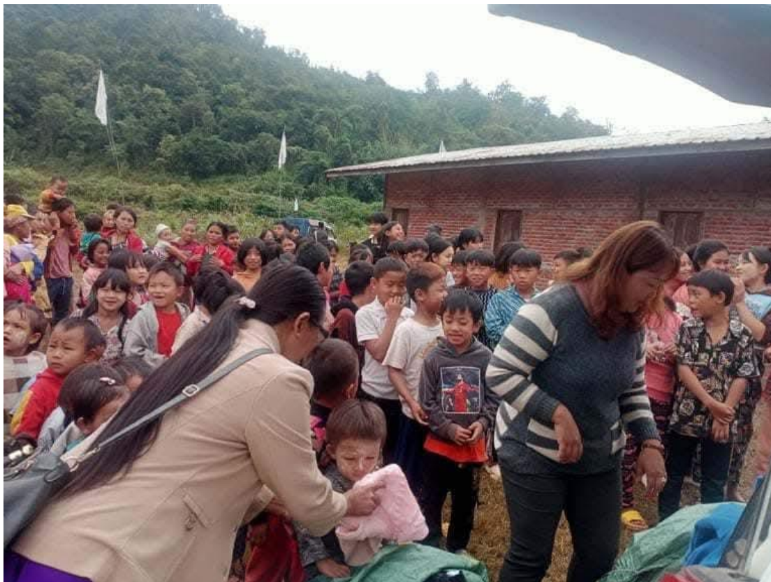
"Children in Northern Shan State line up to receive donated clothing during a distribution organized by local partners. These efforts aim to provide warmth and dignity to displaced families affected by ongoing conflict in the region."