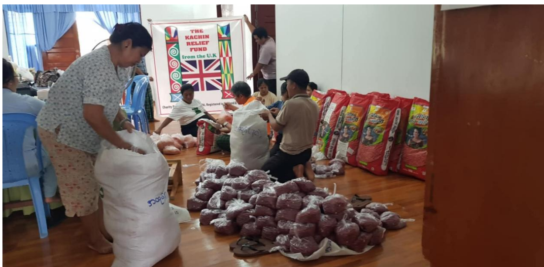
"In 2023, local volunteers in Northern Shan State prepare food packages for delivery to internally displaced persons (IDPs), ensuring vital support reaches communities affected by ongoing conflict and displacement."