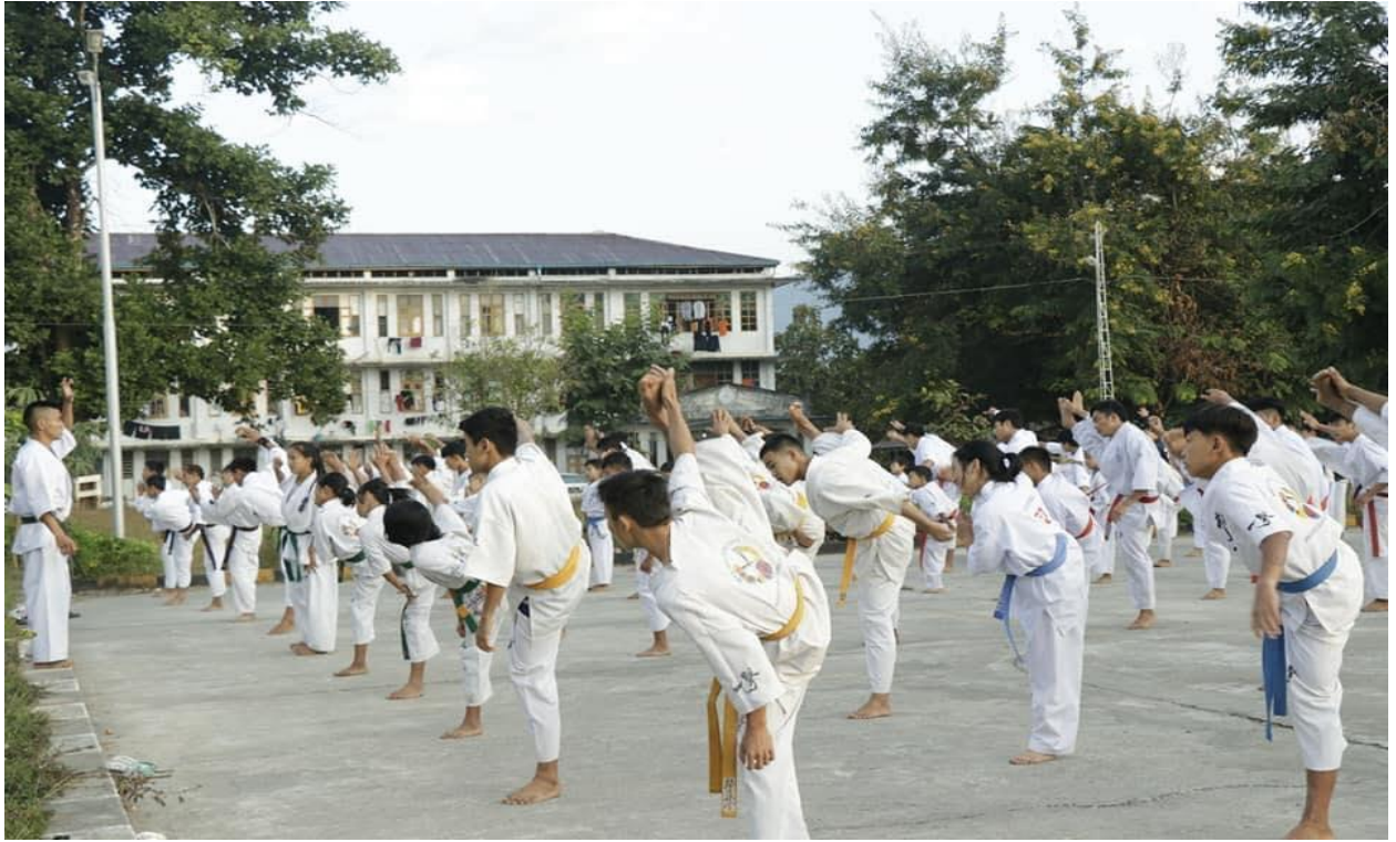
Myitkyina regular karate class 2020.