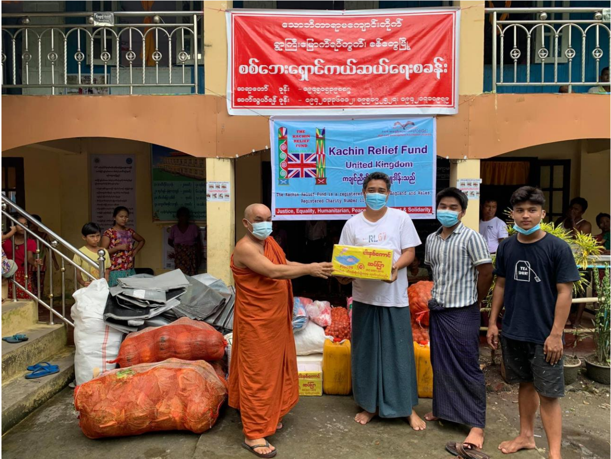
Photo: Rakhine Internally Displaced People, August 2020

KRF continued to support Kachin and other ethnic Internally Displaced who were forced to relocate since 9 th June 2011. In 2019, KRF covered school fare expenses for some Disable children who were struggling to attend local schools in Myitkyina and surrounding areas. Rakhine people has been particularly affected due to heavy fighting between Arakan Army and Burma Army in 2020. KRF managed to deliver aid to Rakhine internally displace people with support from local NGOs. KRF also supported people form far north Putao areas. KRF was very fortunate to received generous donation from the Advance Myanmar to help Covid affected remote areas such as Danai and Northern Shan State.