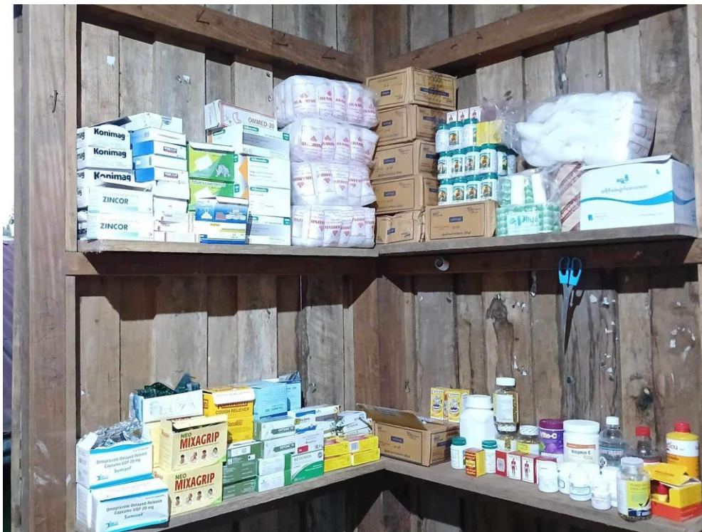
Ngumla High School and medicines for students.