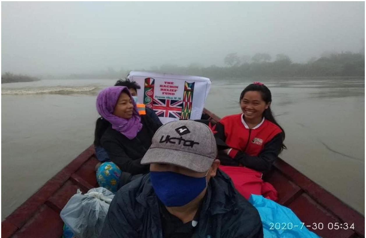
Distributing Aid to local, Danai 2020