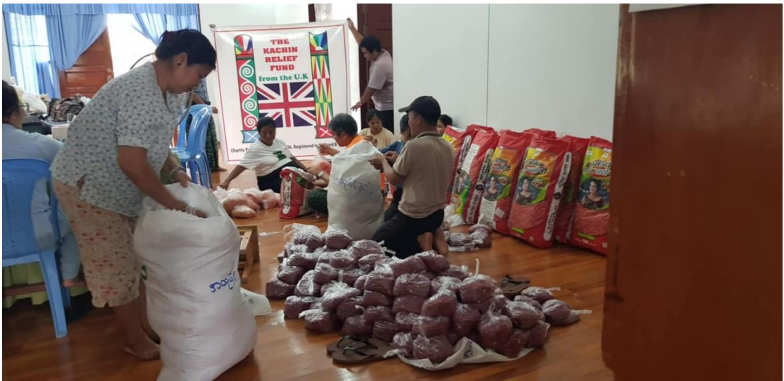
"In 2023, local volunteers in Northern Shan State prepare food packages for delivery to internally displaced persons (IDPs), ensuring vital support reaches communities affected by ongoing conflict and displacement."