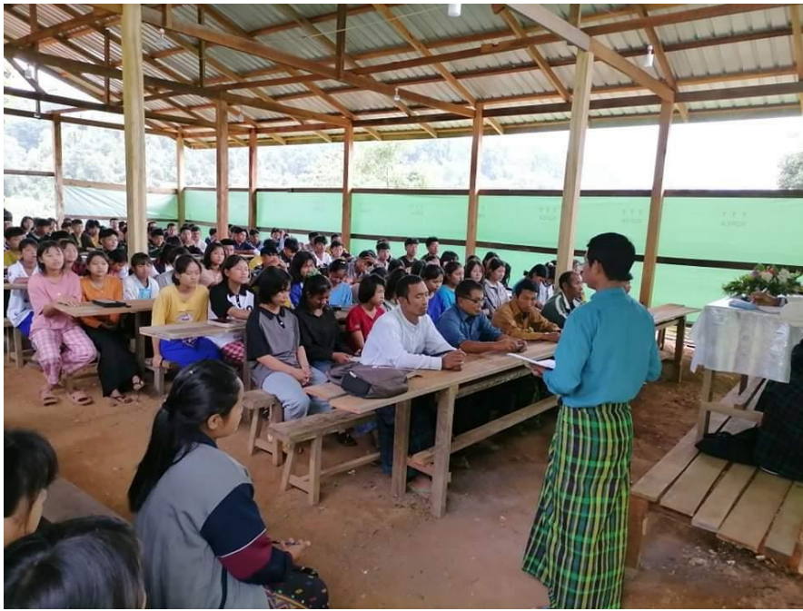
Ngum La School 2023.