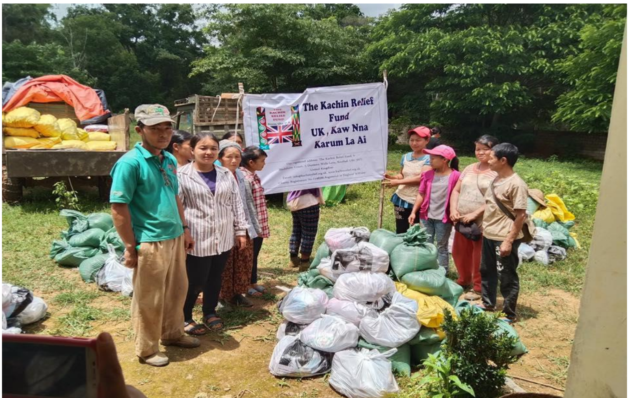
Covid affected community receiving aid from KRF, northern Shan State 2020