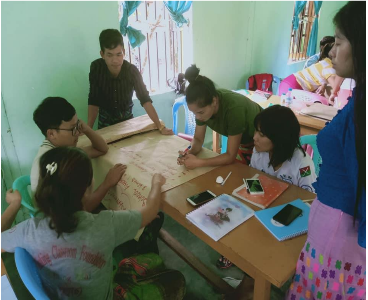
Teacher Training, May 2020.