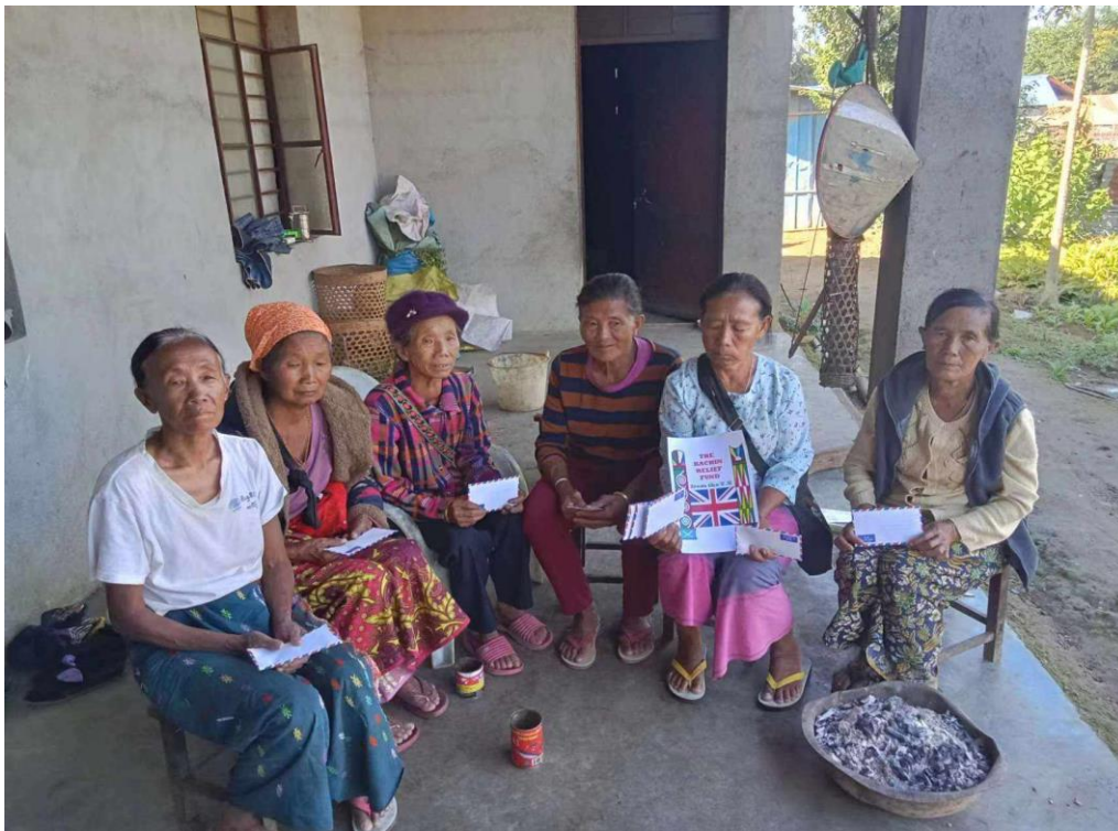
Internally Displaced People from Norther Shan State receiving financial support from KRF.