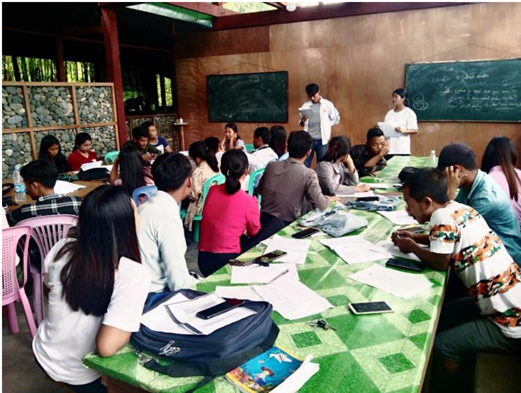
Teacher Training, Kachin State, 2022.

KRF also supported emergency hardship fund to numbers of university students who were studying in South East Asia Countries.