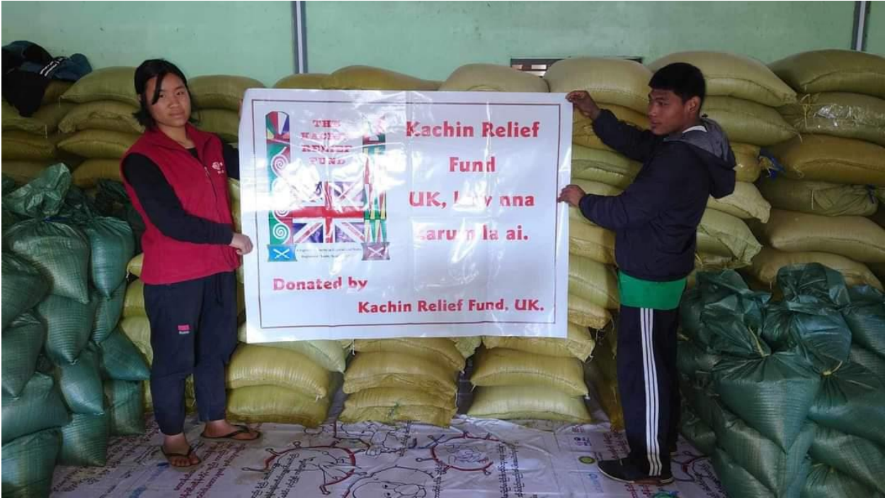
Local receiving food rations from KRF, Northern Shan State.

Despite a challenging situation due to intensive civil wars and travel restrictions, KRF continued working with local NGOs, churches and respectful individuals, to delivered very needed basics food rations, medicines to wars affected areas such as Southern Kachin State and Sagaing Region, Northern Kachin State, Southern Kachin State in Bhamo area. The provisions comprised rice, cooking oil, salt, beans, garlic and onions.