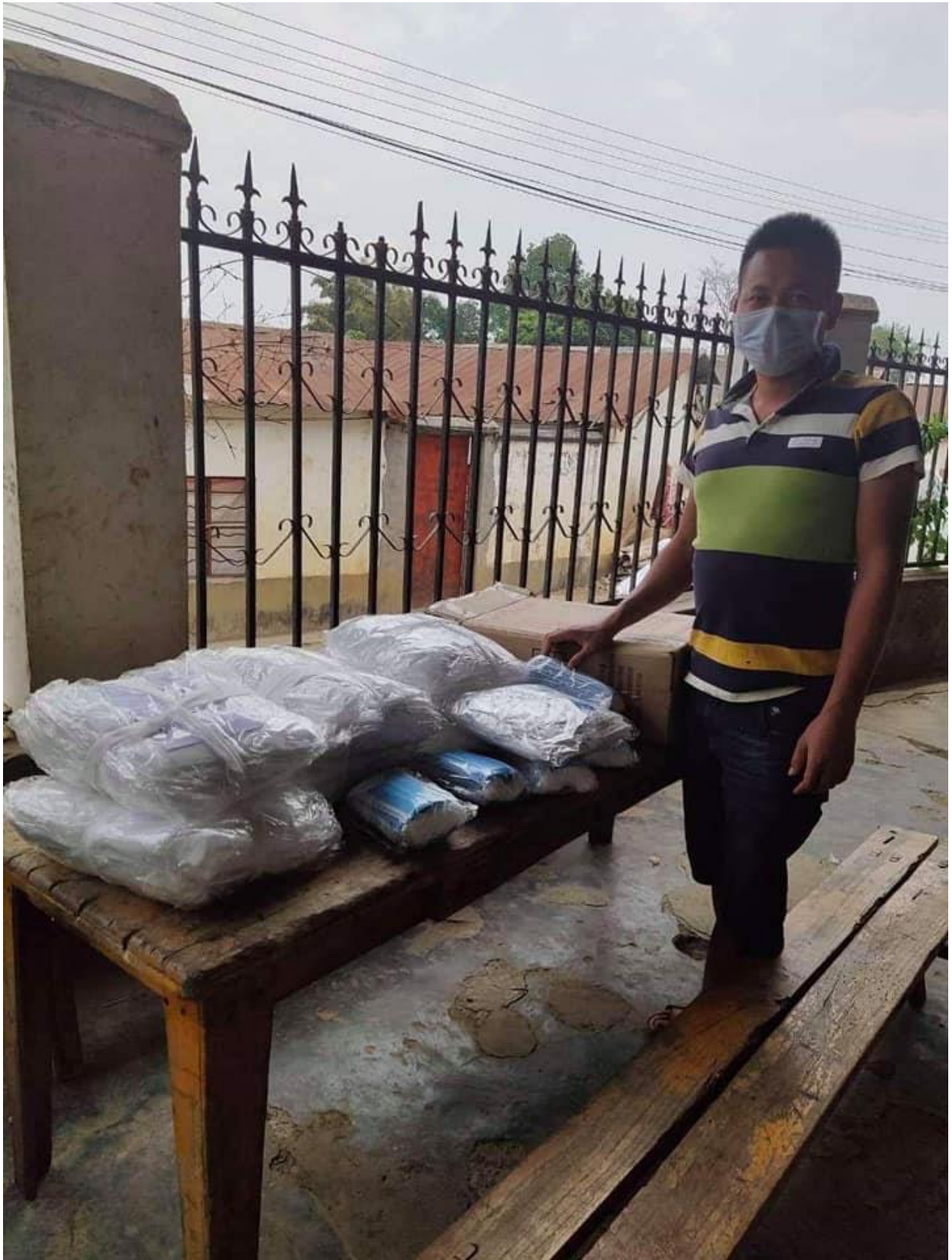
Protective clothing for Covid -19 volunterr group in Maija Yang, 2020