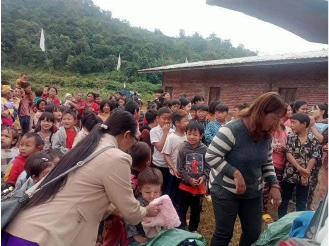
"Children in Northern Shan State line up to receive donated clothing during a distribution organized by local partners. These efforts aim to provide warmth and dignity to displaced families affected by ongoing conflict in the region."