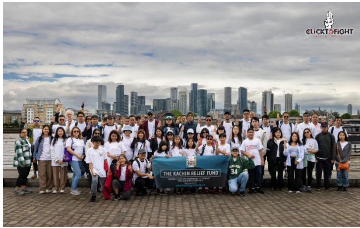
"Trustees and organisers from the Kachin Relief Fund pictured with supporters during the 'Walk for Kachin IDPs' event in 2024. The gathering highlighted solidarity with displaced Kachin communities and raised awareness of the ongoing humanitarian crisis in Myanmar."