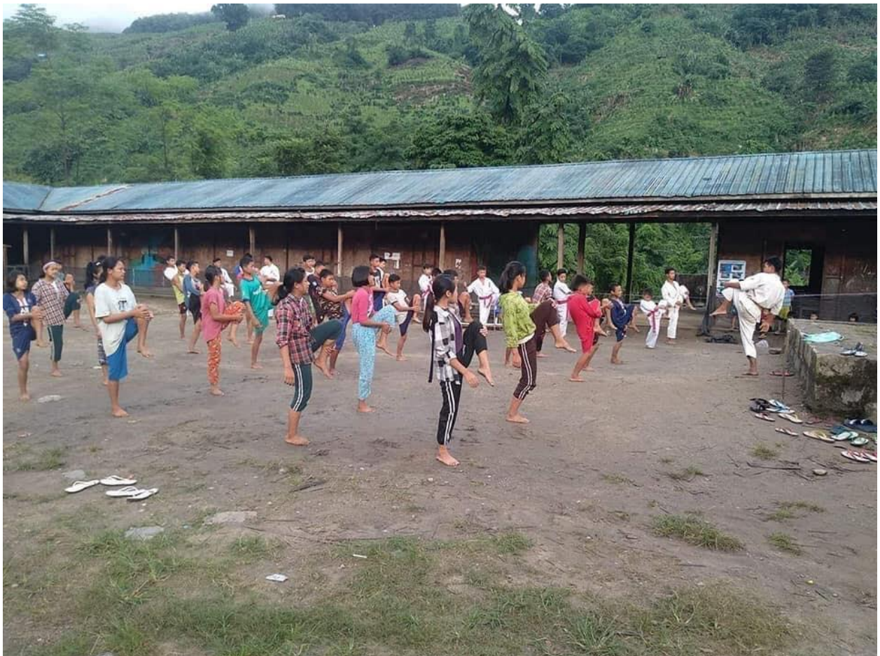
Je Yang IDP camp, beginner Karate class 2019

Since 2014 KRF has been sponsoring (Myu Sha Gin Tawng) Kachin Karate Instructors, and Sport instructors for physical education for IDP children partner with BRIDGE- a local NGO. The project has been highly affective and now over 1,500 children were benefiting from such activities. Some of the activities have been affected due to Covid-19 pandemic in Burma and China-Burma Borders.