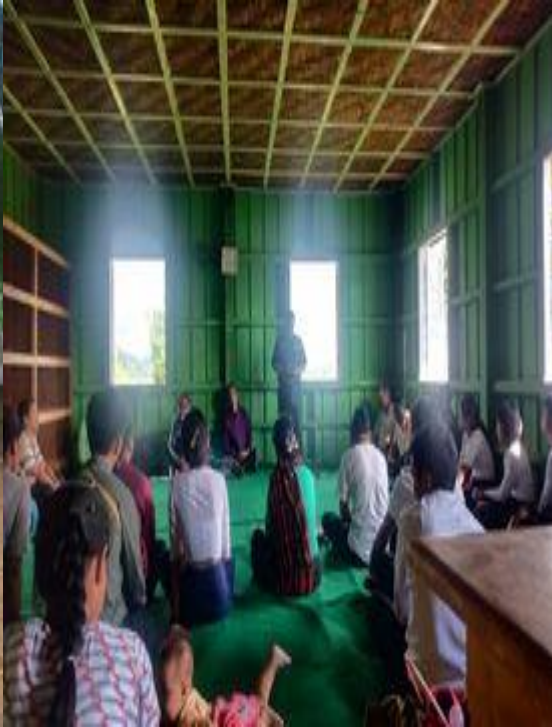
Ngum La library and delivering books 2020