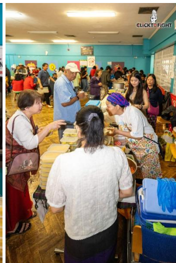
"Fundraising activities organised by the Kachin Community UK during 2023–2024 helped generate vital support for humanitarian aid, education, and advocacy efforts for displaced Kachin communities. These events reflect the community's ongoing commitment to solidarity and action."

The Kachin Relief Fund is deeply grateful to the Kachin Community in the UK and friends of Kachin for their continued support and generosity.