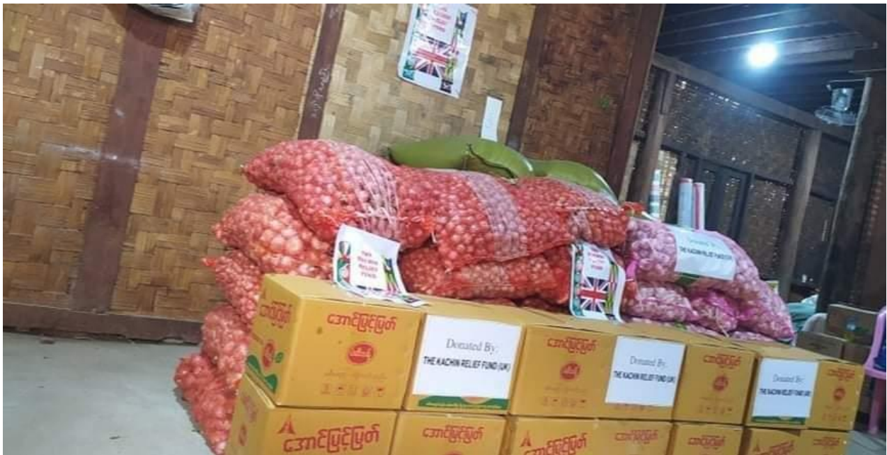
Food provisions arrived at the Nmawk IDP camps, sponsored by KRF, 2021.