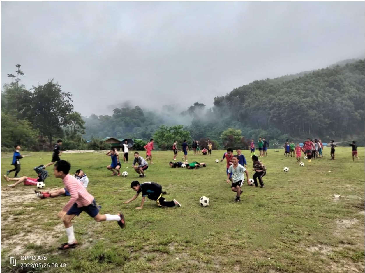
Physical Education programme for IDP children in Maija Yang, Kachin State.