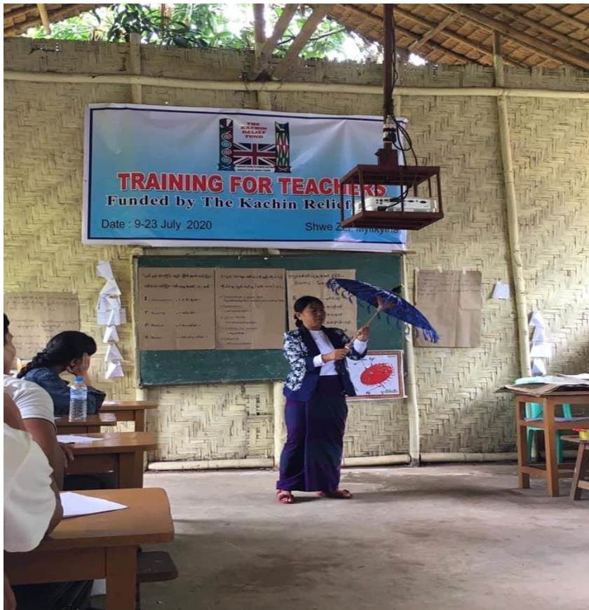
Teacher training, Northern Kachin, 2020

KRF help to build a nursery for local people from Putao area.