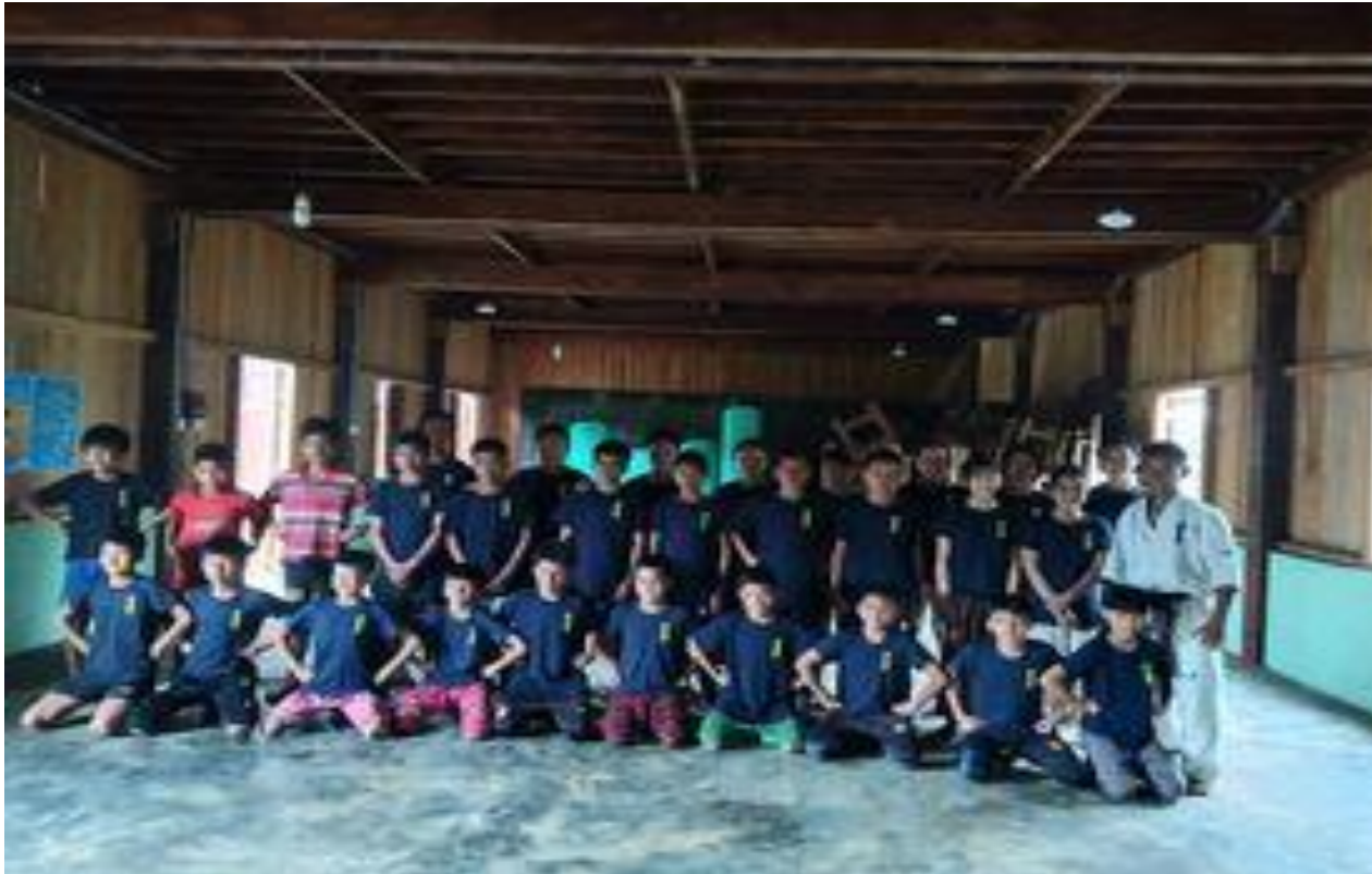
New class in Putao 2020