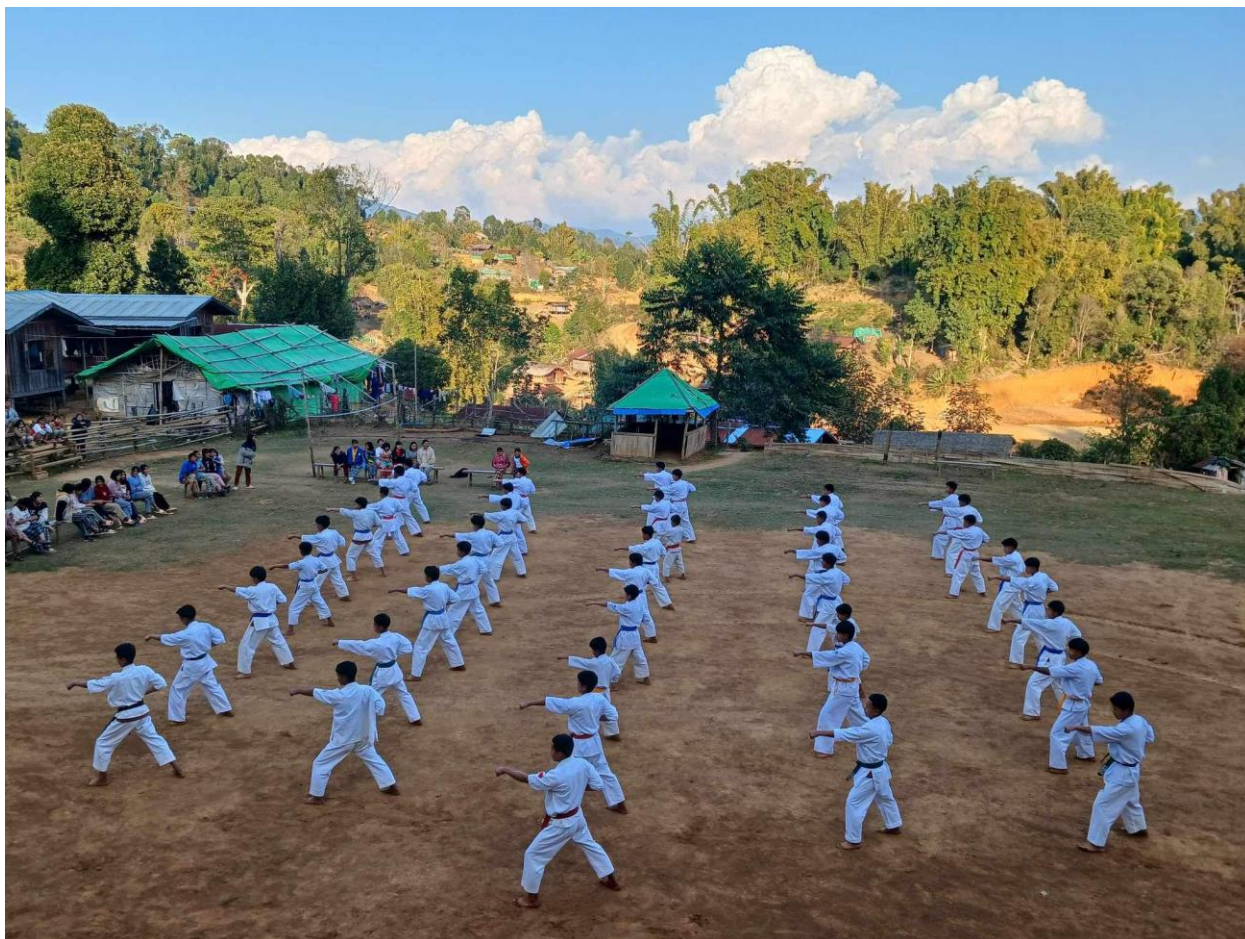
Photo: A Karate Class in Ngum La, Northern Kachin State.