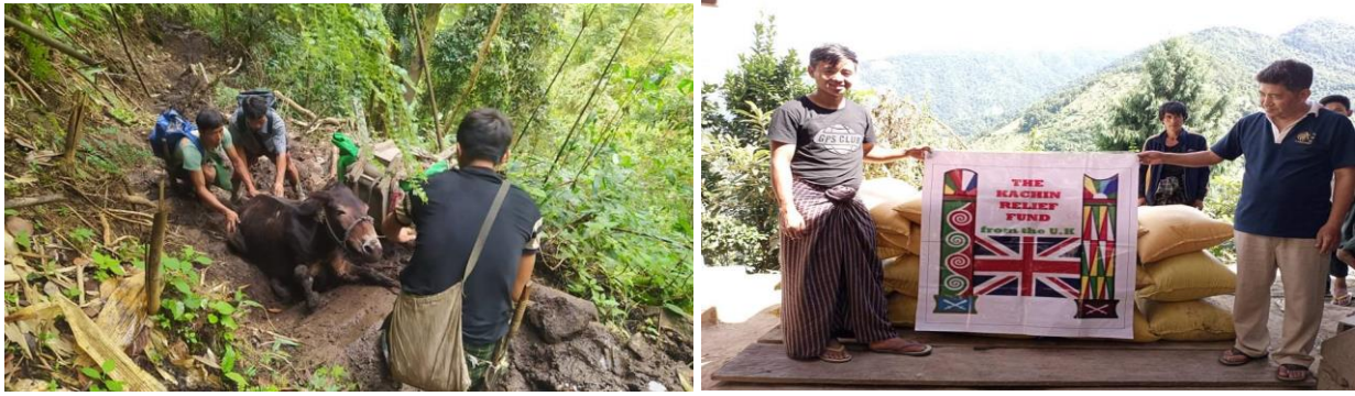
Delivering humanitarian aids to very remote Putao region, May 2021.