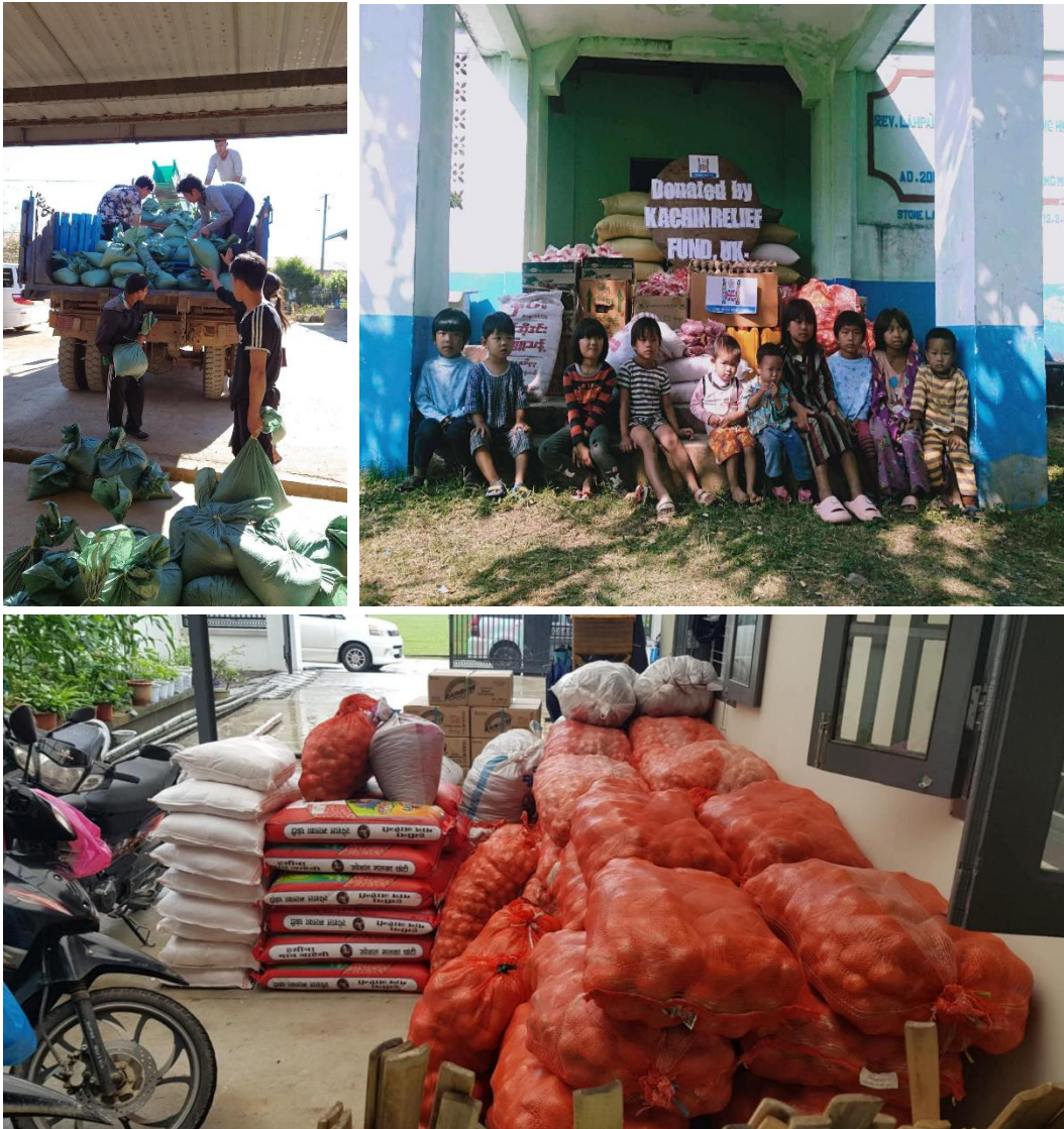
“Kachin Relief Fund volunteers delivering essential food supplies to internally displaced people near Bhamo, Southern Kachin State. Despite ongoing conflict and restricted access, the team continues to reach vulnerable communities with life-sustaining aid, including rice, cooking oil, beans, and other staples”.

Despite the challenges posed by ongoing civil war and travel restrictions, the Kachin Relief Fund (KRF) continued to work with local NGOs, churches, and trusted individuals to deliver essential food rations and medicines to conflict-affected areas, including Southern and Northern Kachin State (Bhamo area), Sagaing Region, and Northern Shan State. KRF also responded to flood-affected villages in the Myitkyina area by providing vital food supplies and medicines. These provisions included rice, cooking oil, salt, beans, garlic, and onions, with cash assistance distributed as a last resort.