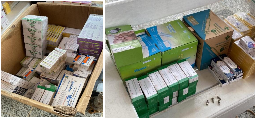
"Medicines being delivered to internally displaced persons (IDPs) along the China–Myanmar border in Eastern Kachin State, June 2024. These supplies are part of ongoing efforts to support communities affected by conflict and displacement in remote border areas."