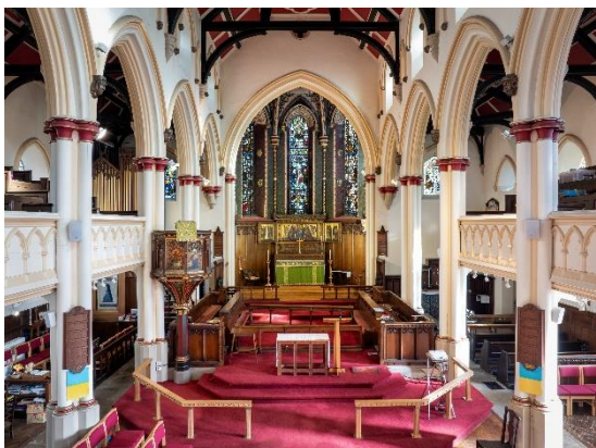
Interior of St Mary the Virgin, Honley