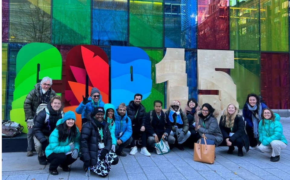
EJM Fellows attend the UN Biodiversity COP15 in Montreal, Canada