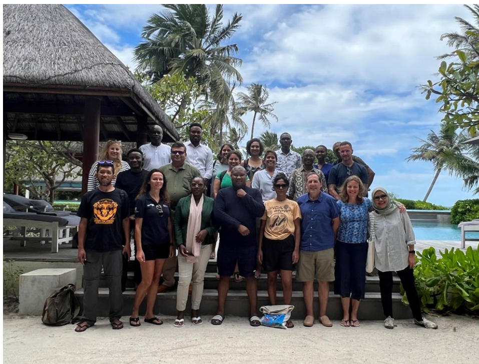
15 journalists from the Indian Ocean region gather in the Maldives for a workshop.

In April 2022, EJV trialled its first ever virtual fellowship , a programme that can be used to provide access for journalists to events in challenging locations, or where resources are limited for in-person programming. Over the year, EJV carried out 3 virtual fellowships to 3 UN conferences – the Convention to Combat Desertification COP15, the UN Climate Change conference COP27, and the UN Biodiversity Conference COP15. These programmes supported 21 journalists who produced a total of 64 stories on these important convenings.