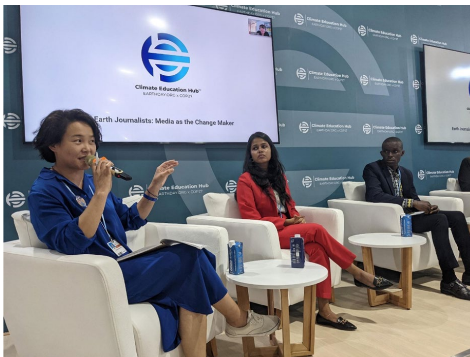
EJN CCMP Fellows speak at a side event at UNFCCC COP27 in Sharm El-Sheikh, Egypt.