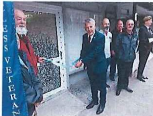
Drop In opening