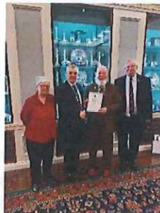
High Sheriff Award