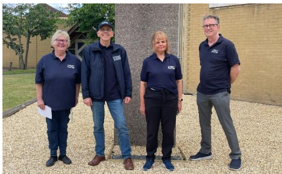
The first Street Pastor Patrol in Southcote

This led on to the first of four new outreach initiatives, ' Southcote Community Street Pastors ', with a team being trained up and sent out from July 1 st to patrol the streets of the parish to be good news and bring good news to the people of Southcote. This has been received hugely positively by the local community.