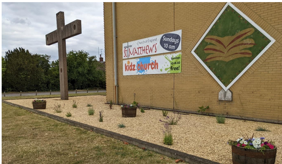
The new ‘Sensory Garden’ soon after it was created early in 2022.