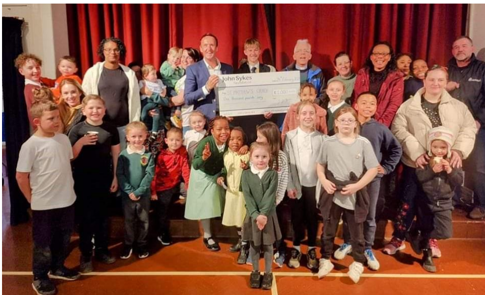
One successful funding bid – thank you to the John Sykes foundation!