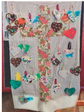
Showing Jesus's love on the cross (Banners, 2024)