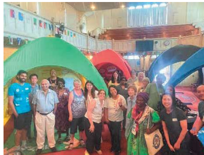
Life Expo Team at Manor Park Christian Centre

Life Expo was held at one location and reached 450 Year 6 pupils (10- & 11-year-olds) from 6 different schools . This year the host church coordinated the volunteers while Faith in Schools coordinated the schools.