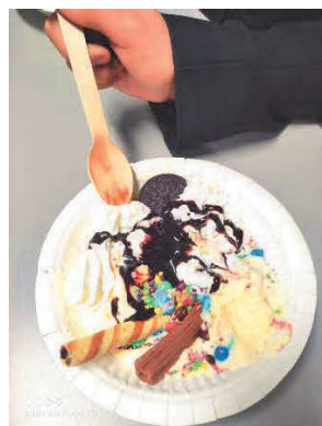
End of term treat!

Through a Newham Mental Health and Wellbeing grant a Calm Club (wellbeing lunch club) was launched in at a secondary school in partnership with a youth worker from a local church. 360 young people have taken advantage of this space and the school is requesting another club to be opened on their second site. This project is pastoral based with the young people enjoying playing games, crocheting and other crafts. They have a space where they can ask faith-based questions.