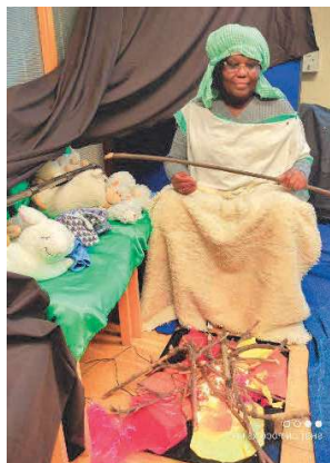
Shepherd keeping warm (CJ Manor Park 2024)