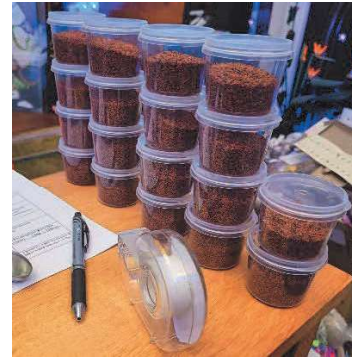
Sowing the seeds! Prep for gardens (Volunteers prep, 2024)

Life Expo was held at one location and reached 450 Year 6 pupils (10- & 11-year-olds) from 6 different schools . This year the host church coordinated the volunteers while Faith in Schools coordinated the schools.