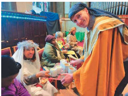
Sharing lunch between sessions (CJ Forest Gate 2024)

Our Christmas Journey saw an amazing 3003 Year 1 pupils (5- and 6-year-olds) plus parents and schools staff attend from 42 different schools . The event was held at 7 host churches over 8 days and involved 123 volunteers from 31 different churches who gave a total of 1102 volunteering hours . These figures show an increase of 9% in pupils seen and 51% for volunteers and hours given from Christmas Journey 2023.