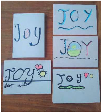
Creating Joy through writing (Calligraphy 2025)