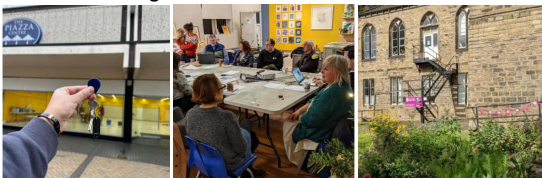
(l to r) keys to the new meanwhile space in Huddersfield; members at the AGM in Mirfield gallery; outside of the Mirfield site and the dye garden

All available studios at WYPW remained full in 2023/24 with a long waiting list. Studio 6B remained closed except for use as a textile printing space during the summer due to some need for refurbishment to be used in the winter period. Rent for studios was increased slightly (4%) but was kept low to support our studio artists, particularly after the difficult cost of living crisis and recession. Upgrades were made to studios and the building as a whole with work to the dark room for damp work, repair to the roof slates to prevent leaks and compliance work. This 'hidden' work maintains high standards for the workshop and a safe space for all. There remains a long waiting list for studios at WYPW and there is demand from artists for long term working space. Many thanks to all our studio holders for supporting WYPW through a difficult period – especially with events such as Print Day in May, with volunteering work days and with their good humour and advocacy. We expand our studio provision to Huddersfield with the sub-letting of some of the new space to Thread Republic as well as the creation of some shared studio space at the back of the unit.