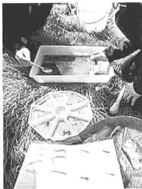
RiverFly Training Day 2022