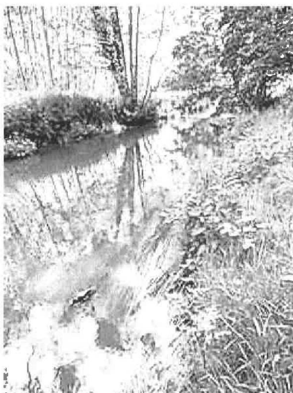
River Rother 2022

Working with the Environment Agency, estate owners and supported by the Ouse and Adur Rivers Trust team, this year we further developed plans for by-pass of a major barrier to fish on the River Rother. In order to provide further evidence for the final design, plans have been developed for a trial of sluice removal in early summer 2023. This was delayed due to high water levels, and subsequently we have extended the project to March 2024. When completed this will increase passage for all species of fish along 12km of the river.