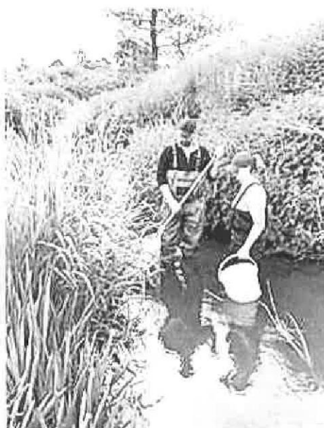
RiverFly Monitoring on the Rother 2022

This year we have delivered and developed a range of projects across the Arun & Western Streams catchment, including in-river enhancement, restoration plans, citizen science monitoring and engagement.