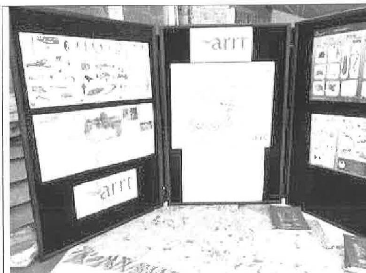
ARRT @ Coultershaw Heritage Day 19 June 2022