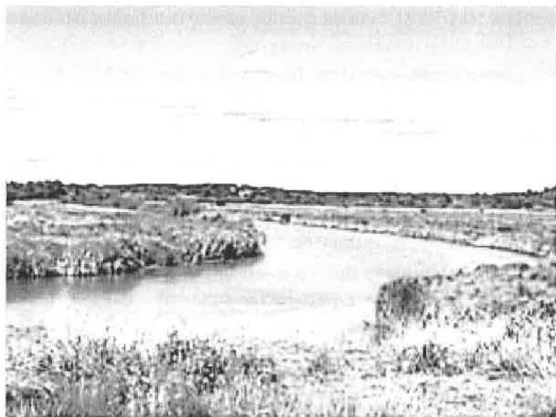
River Arun 2023

The Catchment Management Plan for the Arun & Western Streams has been drafted, which utilises a modelling approach to help identify areas for future partnership work. The plan will be published next year along with a refreshed partnership website.