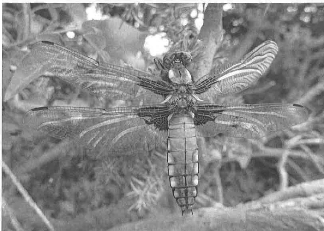
Dragonfly, Broad-Bodied Chaser ( Libellula depressa )