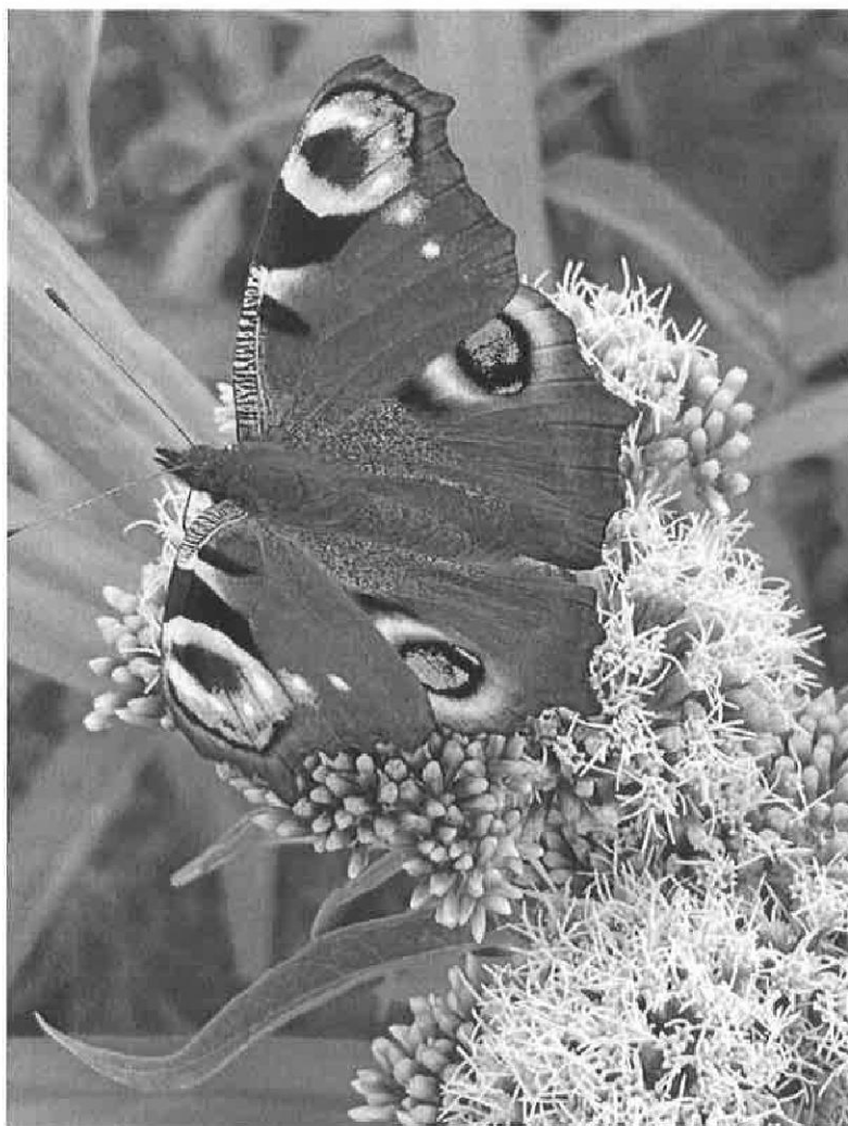
Butterfly, Peacock ( Aglais io )