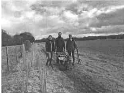
Hedgerow Planting at Petersfield

We have recently been successful in an Ofwat Water Innovations Fund multi partner project called Catchment Systems Thinking (CaSTCo), led by United Utilities and the Rivers Trust. This aspirational project will deliver a step-change in citizen science water quality monitoring across our operational area and will be a new focus for ARRT over the next two years.