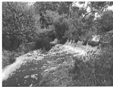
River Arun (Lordings Lock)