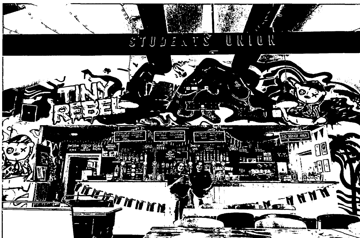
Tiny Rebel Mural, Northfield Bar

2018/19 v. 2022/23 Drink Comparison: 47% increase