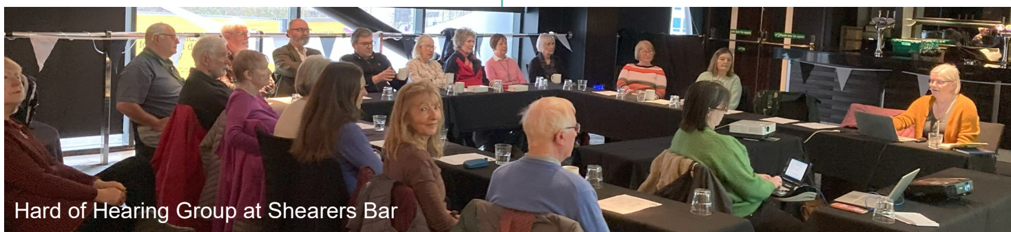
Hard of Hearing Group at Shearers Bar

Attendance has remained lower than prior to lockdown although 20 members requested to stay on the email circulation list, some in case they needed to attend others to stay connected to a source of support.