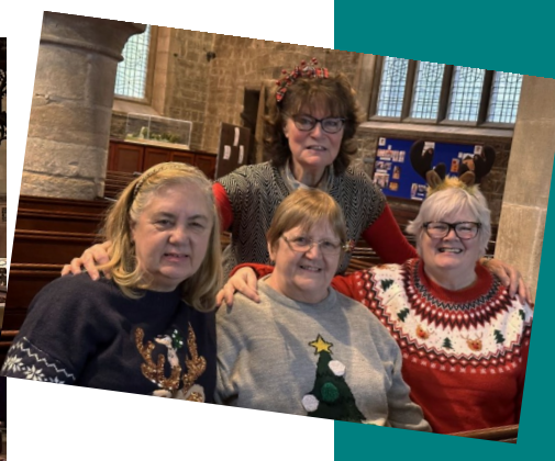
Carol Service, December 2022