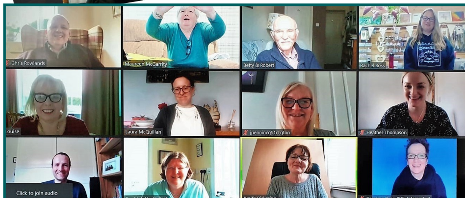
Board meetings on Zoom