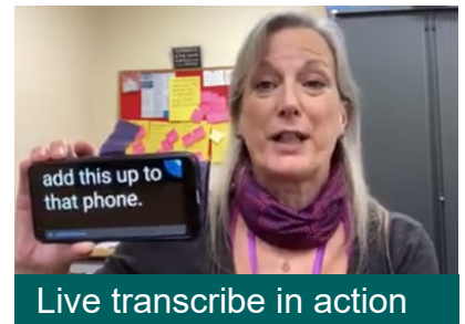
Live transcribe in action

We found a range of solutions to help everyday life with face masks, which make conversation even harder to follow. Solutions included using the sunflower lanyard, "I lip read" badges and Nexus Bridge cards (these alert staff to the communication needs of an individual). One new development has been live transcribe an app free on android phones that provides speech to text support for conversations. We have supported several people to download and use on their phones and have had very positive feedback about the positive impact it has had.