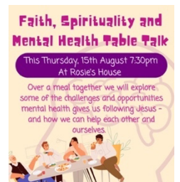
Table Talk Event – one of our learning meals, this time to explore the intersection of faith, spirituality and mental health.

Immersive Experience - we ran residential training for two trainee ministers, giving them a breadth of experience across CFS and Shared Space, supported by taught theological reflection sessions.