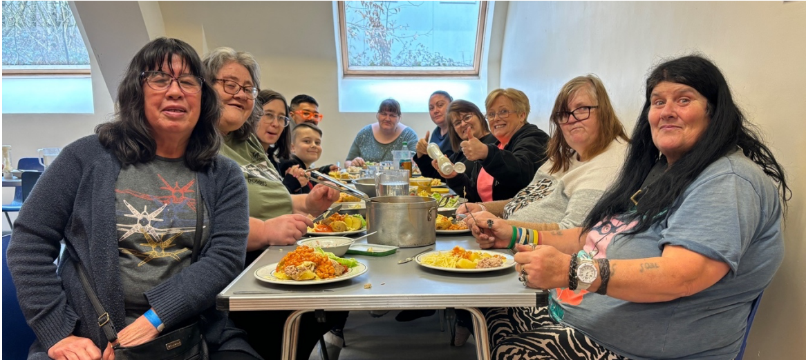
CFS and SS Big Weekend Away – Feb 2024