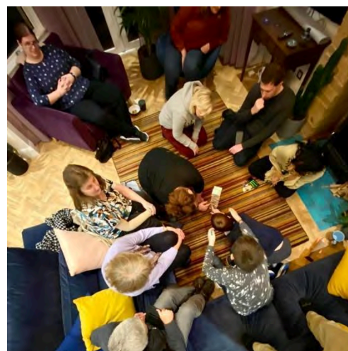
Group work at a CFS gathering

At the heart of CFS is the community groups. These are often home-based and typically organise around a weekly meeting where we work out what it means to live as followers of Jesus. The communities can be found in south east Essex. They provide opportunities for discipleship and transformation as people develop relationships of trust together over shared meals and through shared lives. Many marginalised and disadvantaged people are part of the groups, and British Sign Language is used in one to include the deaf.