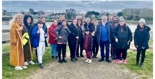
Church Away Day in South Woodham Ferrers

Outreach fireworks and fellowship party and prayer event. Safeguarding training organised by CFS in line with Policies and Procedures