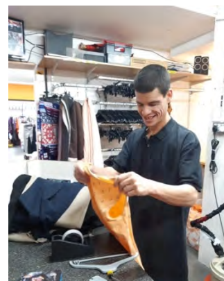
One of the 100 Shared Space volunteers

Our minister leads the work of Shared Space, and at the start of the year developed it to include new work with refugees and asylum seekers in Southend with which we are actively partnering.