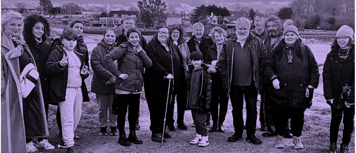
Those who braved the walk on the 2023 CFS Away Day