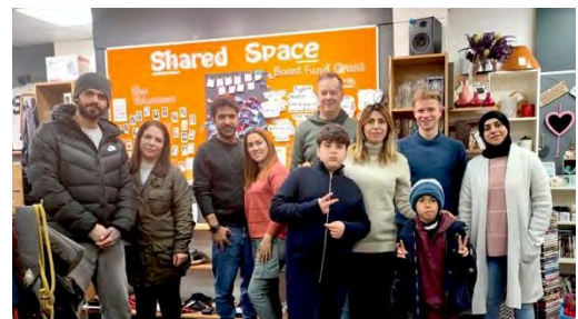
Volunteers in one of the Shared Space shops

We held theological reflections over zoom and in person to develop people's ability to think as Christians and teach theological reflection skill to participants.