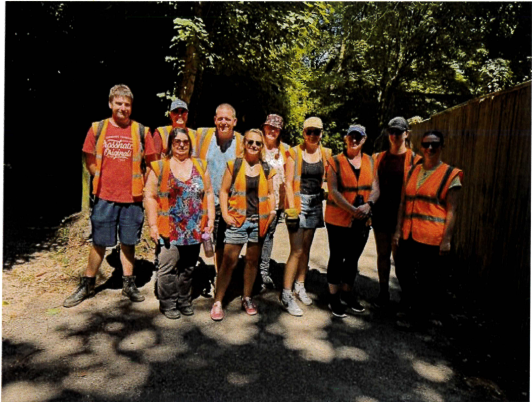
A group from HM Land Registry volunteering on the hottest day of the year!