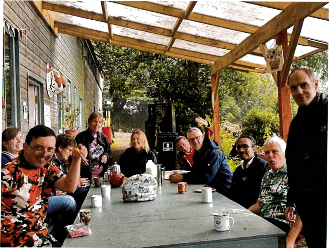
Volunteers and staff enjoying a chat over a cup of tea