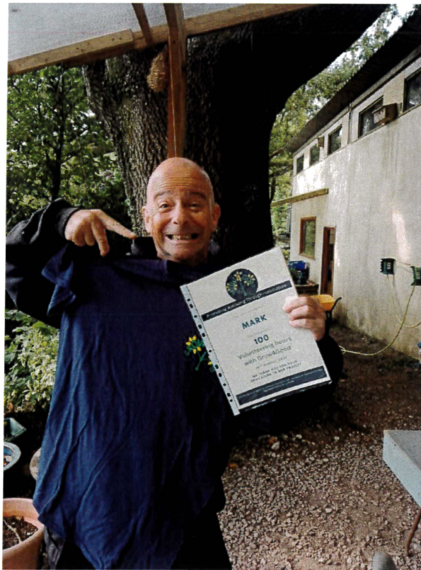
Volunteer receiving his 100-hour certificate and T-Shirt