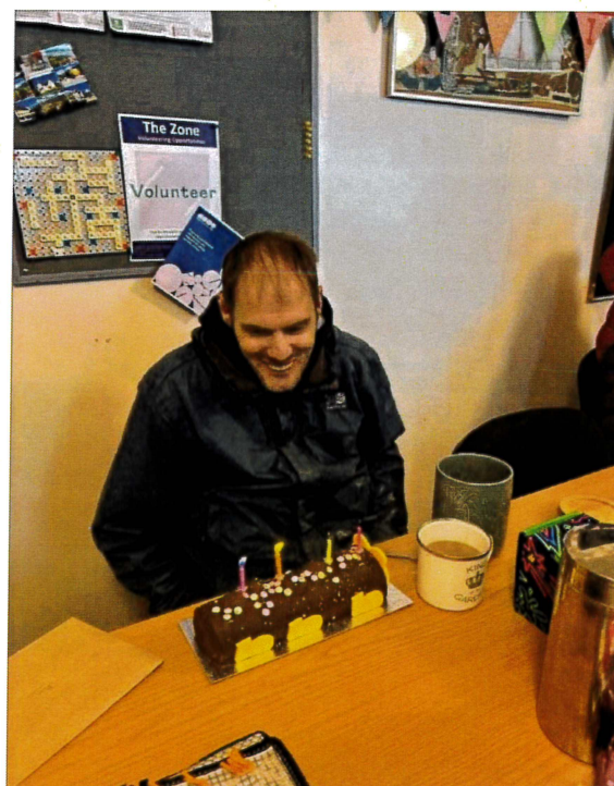
Chocolate cake is his favourite!