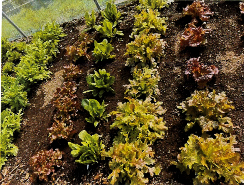
Rows of salad ready to be picked