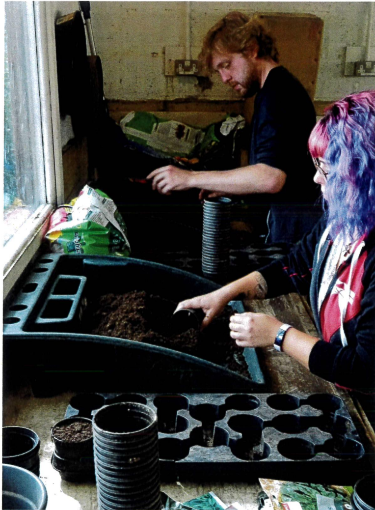
Students sowing seeds