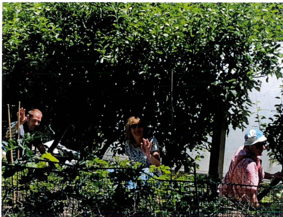
Volunteers working in the coolest part of the plot during the hot summer of 2022