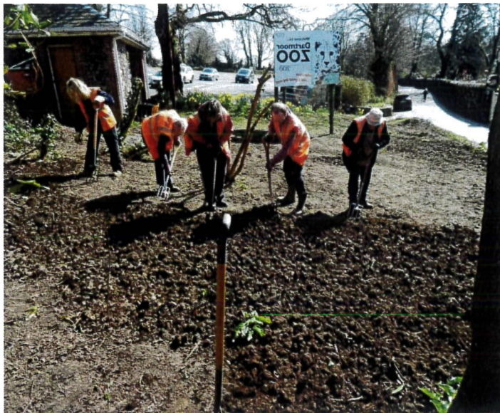
Volunteers clearing the ground by the zoo entrance ready to sow grass seed.