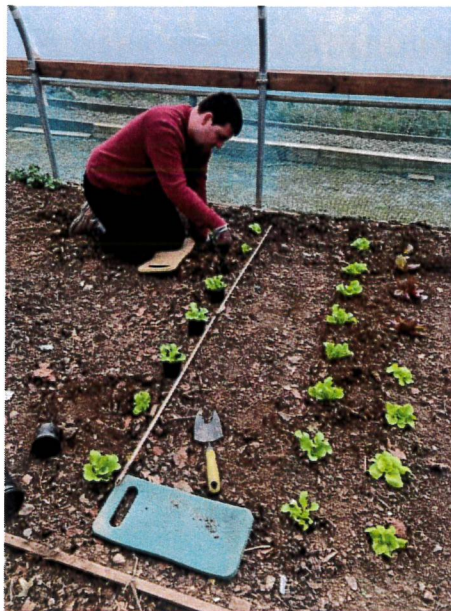
Planting out lettuce seedlings in the polytunnel