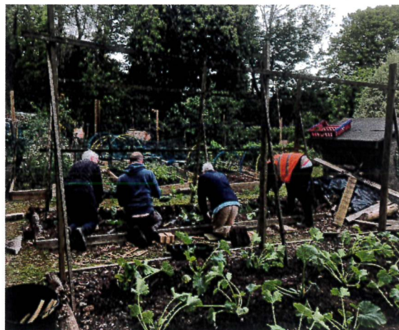
Planting out runner beans on the G4G plot