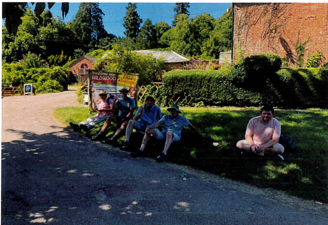
Sitting in the shade after a very hot day at Wildwood Escot