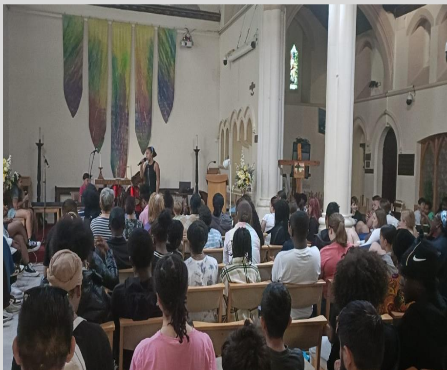
New Youth band at recent Access- Youth Service