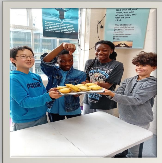
Young people from Saturday club learned about the Christian faith through a poster gallery and bible study. They are working on a pie shop to raise funds.