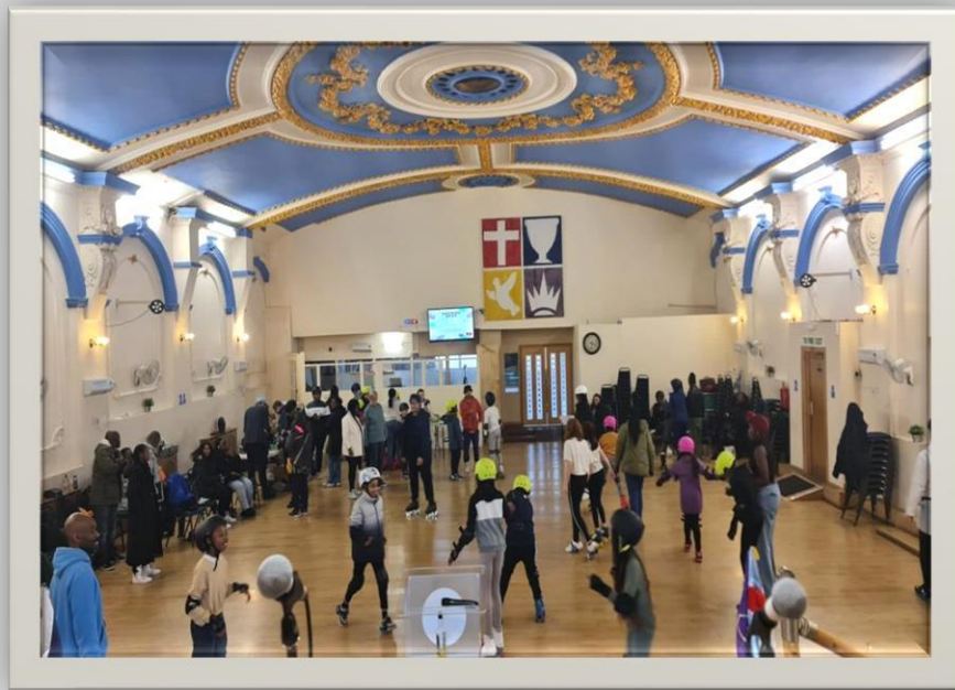
Access-Young people came together for a youth service where the highly gifted Access Choir lead worship alongside guest speakers and testimonies. Young people also enjoy roller skating and food.