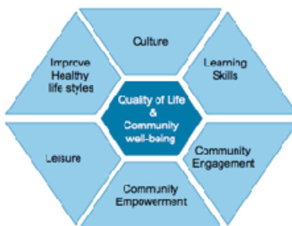
Figure: 1 Pavilion as a multi-faceted resource

We have planned to convert the Pavilion for the following purposes for the betterment of the local community.