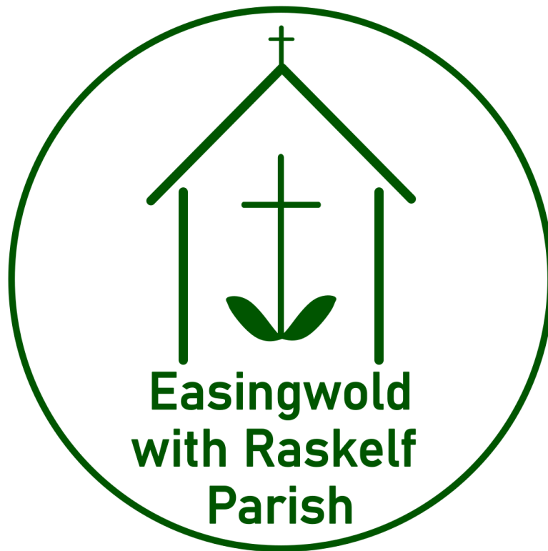
St. John the Baptist and All Saints, Easingwold