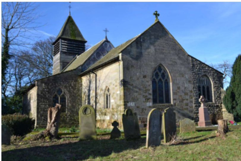
St Mary's Raskelf