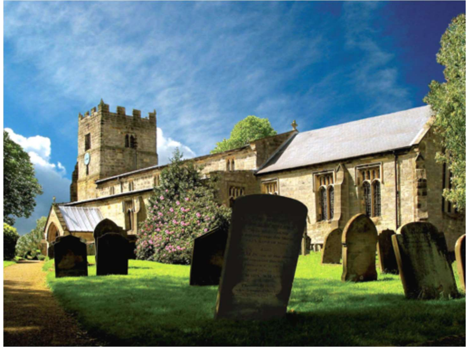
St John and All Saints Easingwold