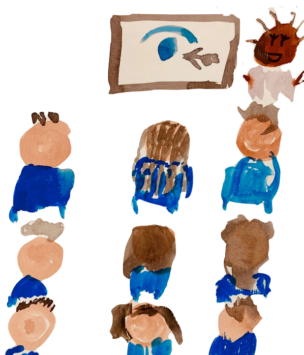
'A classroom full of student nurses' by Karis Faith Samoutou.

Our ten students continued to learn alongside qualified staff at the IEC. They attended each day and received a range of tuition including