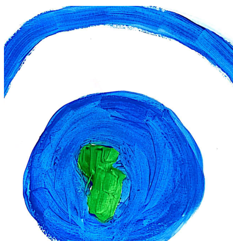
'New Sight Logo' by Karis Faith Samoutou.