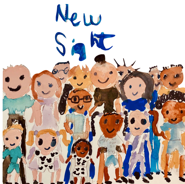
'Ouesso Pioneer Team' by Karis Faith Samoutou.

Three key goals for 2020/2021: 1. To provide accessible and comprehensive eye services; 2. Empower the local community; 3. Ensure sustainability by partnering with local and international partners.