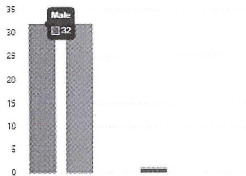
Gender of the young people in the service.