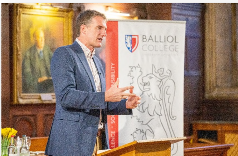
Dan Snow delivering his lecture, 'Finding Endurance: adventures of a public historian'.