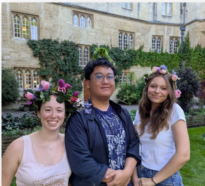
Students with flower crowns made for May Day.