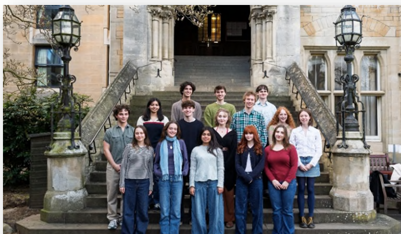
William Westerman Pathfinders 2025.