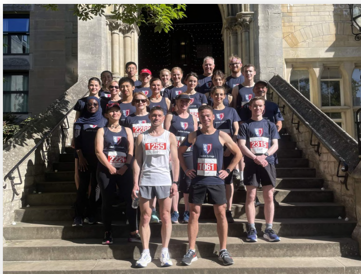
Team Balliol before setting off for the Oxford Town and Gown 2025 Run

triennial Indian religious festival of the Kumbh Mela , and a one-day workshop sponsored by the Balliol Interdisciplinary Institute on language-teaching and -learning in the late medieval and early modern Mediterranean . In combination, the talks given in series, each unique in themselves, make for a gloriously omnivorous intellectual diet. This year's offerings, delivered in the context of scheduled Oliver Smithies Lectures or Research Consilia, were on topics covering everything from black holes and qubits to colonial giraffes and architecture, from the ancient origins of modern mindfulness and of democracy and populism to Wikipedia entries and business climates, to scientific explanations and servant reading cultures, to