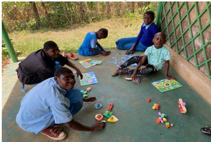
Children at Rehema enjoying the facilities