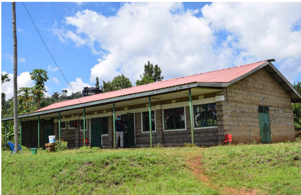
Rehema Early Intervention Centre for children with complex needs - open and ready for business - May 2021

During the year farming continued and equipment for the centre was purchased and organised and the facilities made ready.