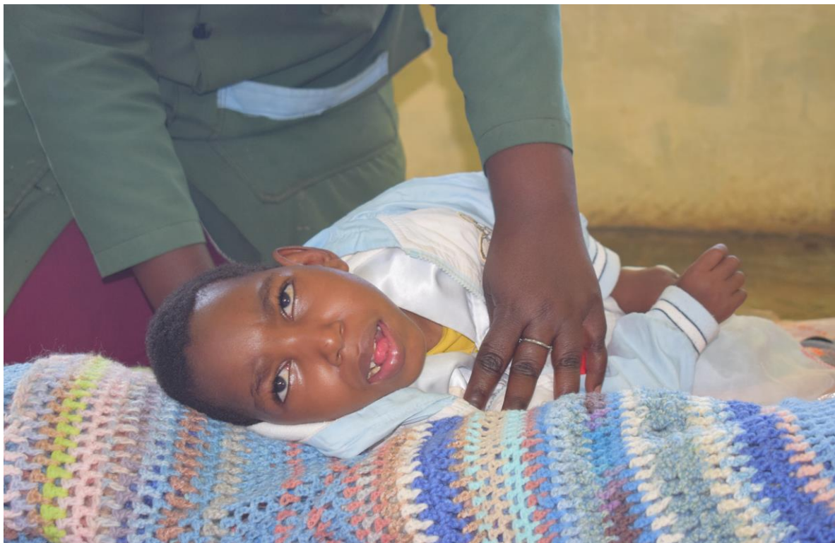
Training for Care Givers is important and physios regularly visit our units to share good practice.