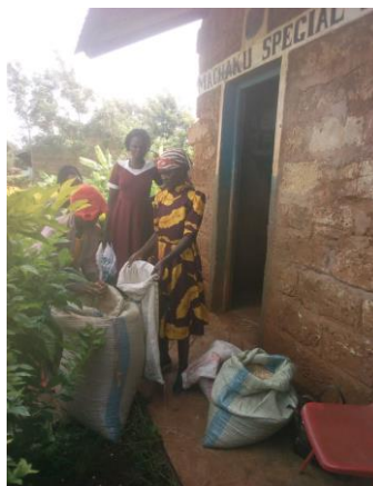
A large scale food distribution was undertaken to respond to the COVID crisis through our special school network