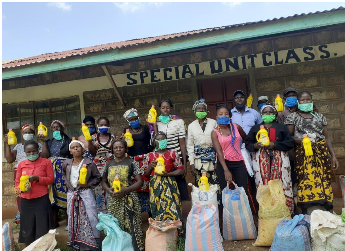
The Food Parcel Project - part of our COVID 19 Pandemic Response

Name of the Charity: Friends of Kianjai, Kenya