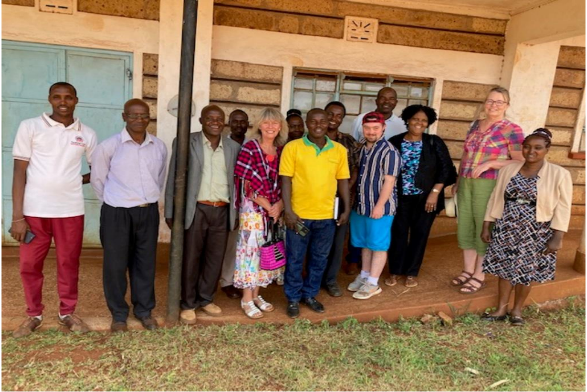
Trustees and volunteers visit the Mituntu Vocational Training Centre