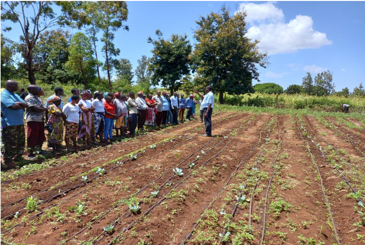
Explaining the Permaculture method -The Local Community meets at Ciaikuru for a School Farm open day

Signed on behalf of the trustees on the 21st December 2022