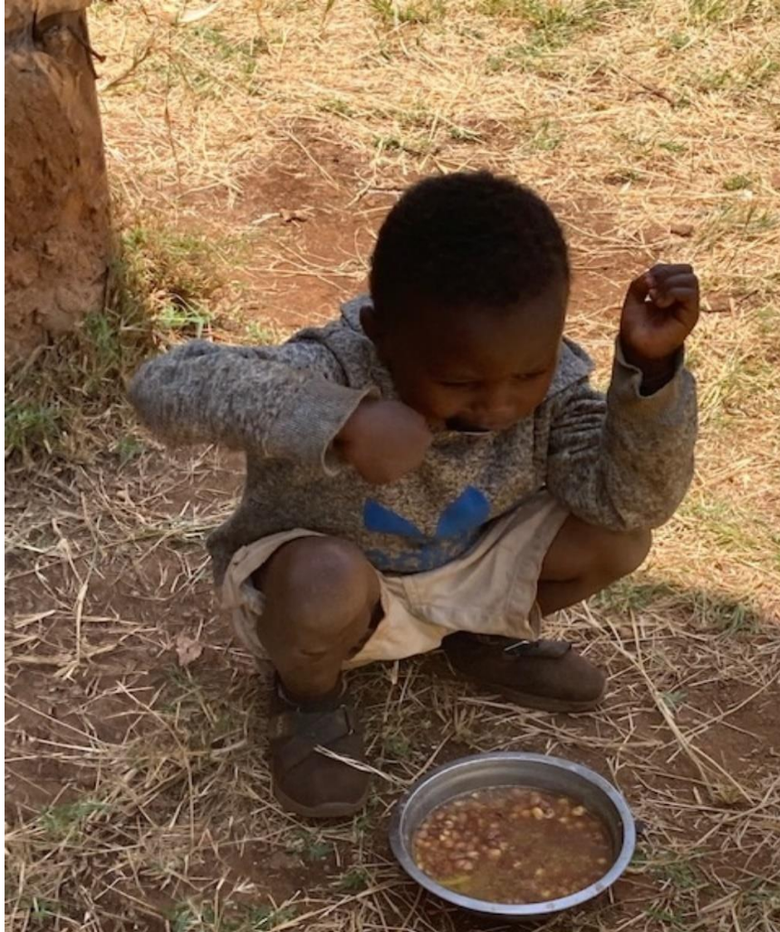
Kindergarten child at Uringu school eating lunch prepared from drought resistant maize and beans grown on the school farm.