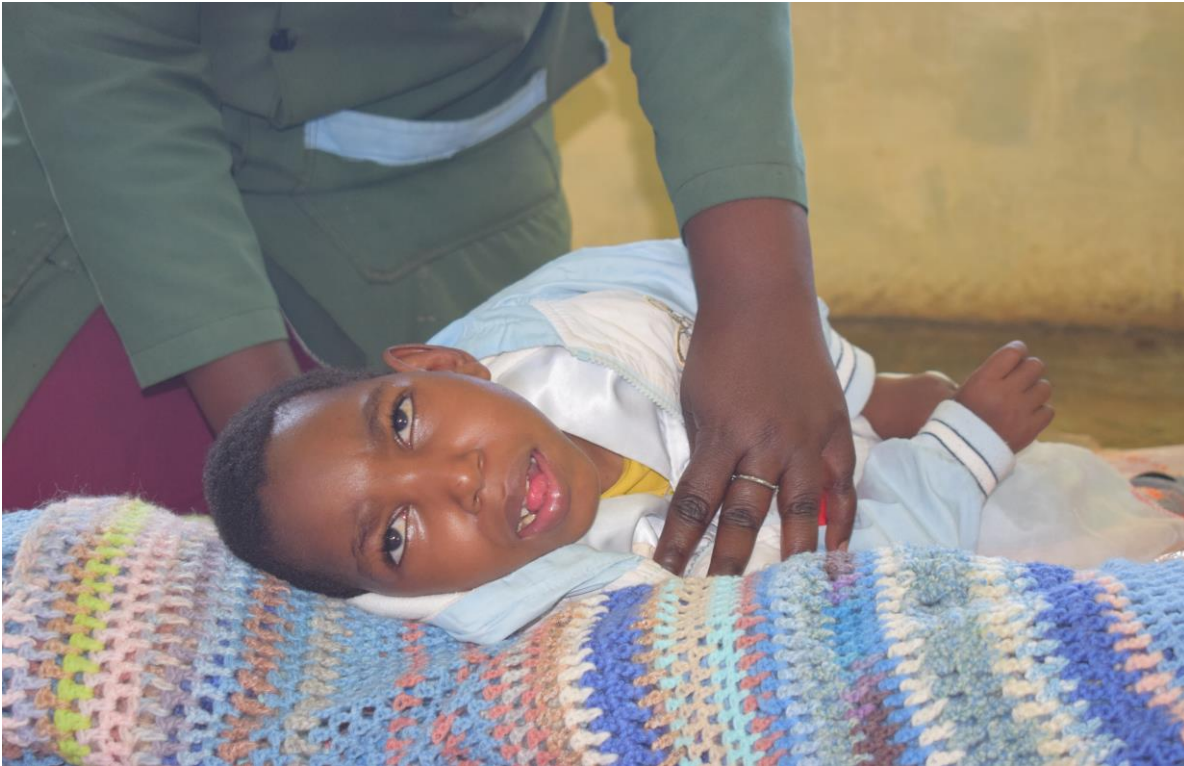
Training for Care Givers is important and physios regularly visit our units to share good practice.