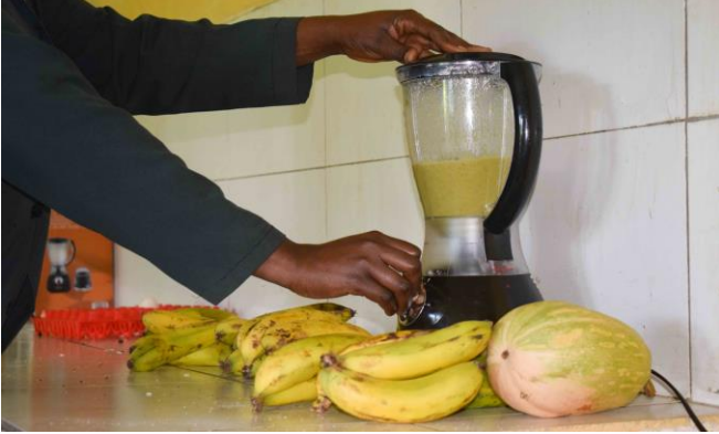
Preparing nutritious food in the Rehema Kitchen

During the year farming continued with a focus on providing food for the centre and selling produce and milk.