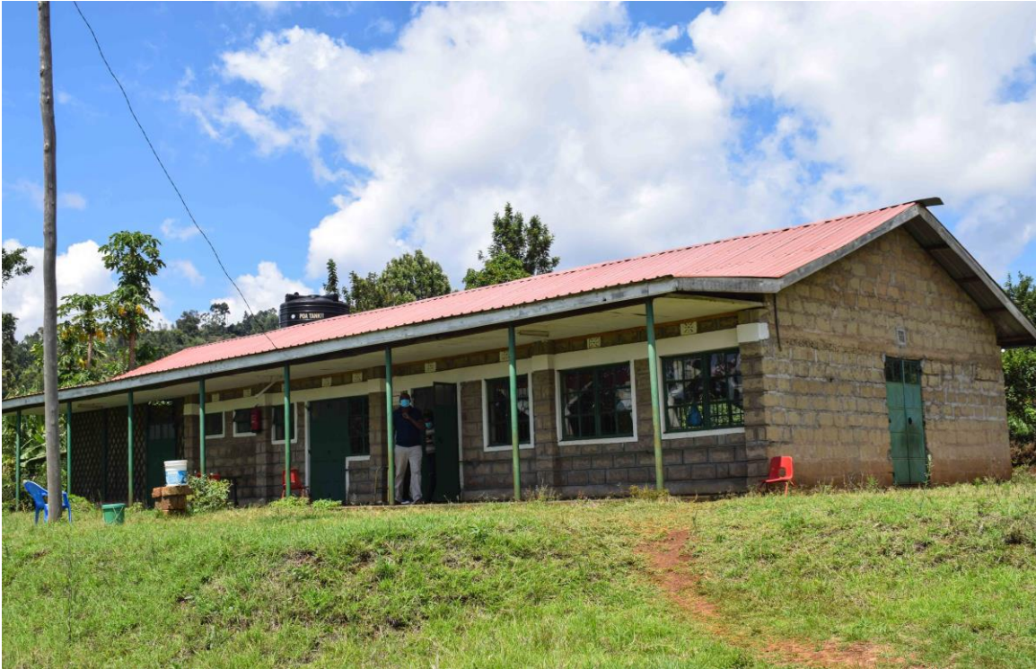
Rehema Early Intervention Centre for children with complex needs - open and ready for business - May 2021

During the year farming continued and equipment for the centre was purchased and organised and the facilities made ready.