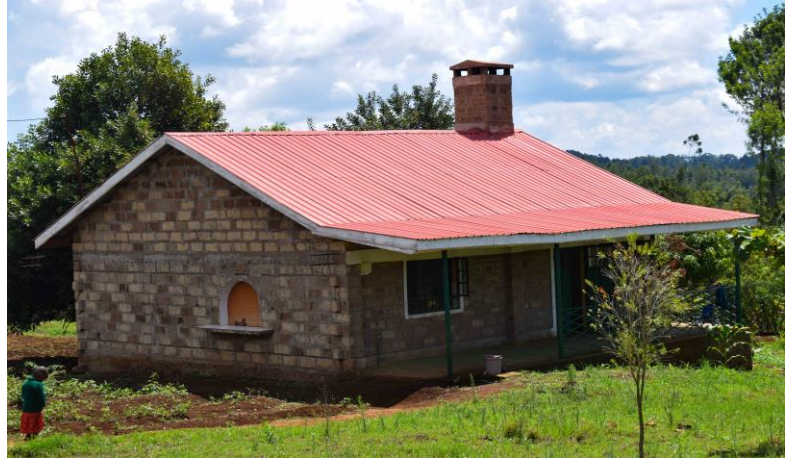
Rehema Kitchen and store