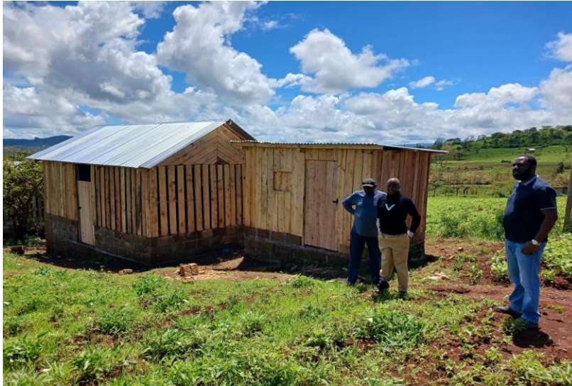
Farmworker's house and chicken shed at Mituntu VTC