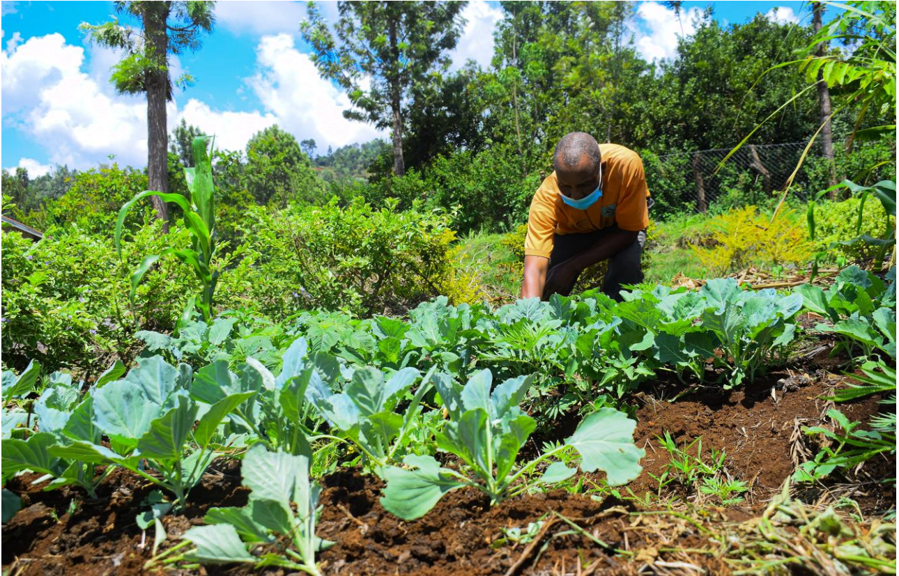
Permaculture farming is an important part of our Food Security Objective