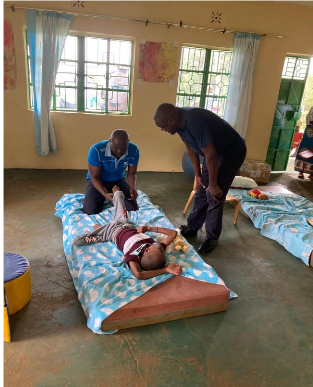
Parents and Physiotherapists at Rehema