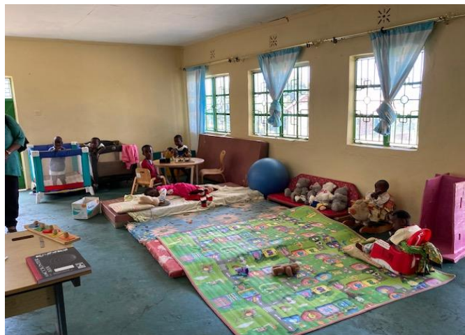
Children at Rehema enjoying the facilities

The equipment lending library for disability aids continues to be maintained at the Rehema centre.