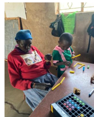
Learners and Teachers with puzzles and play