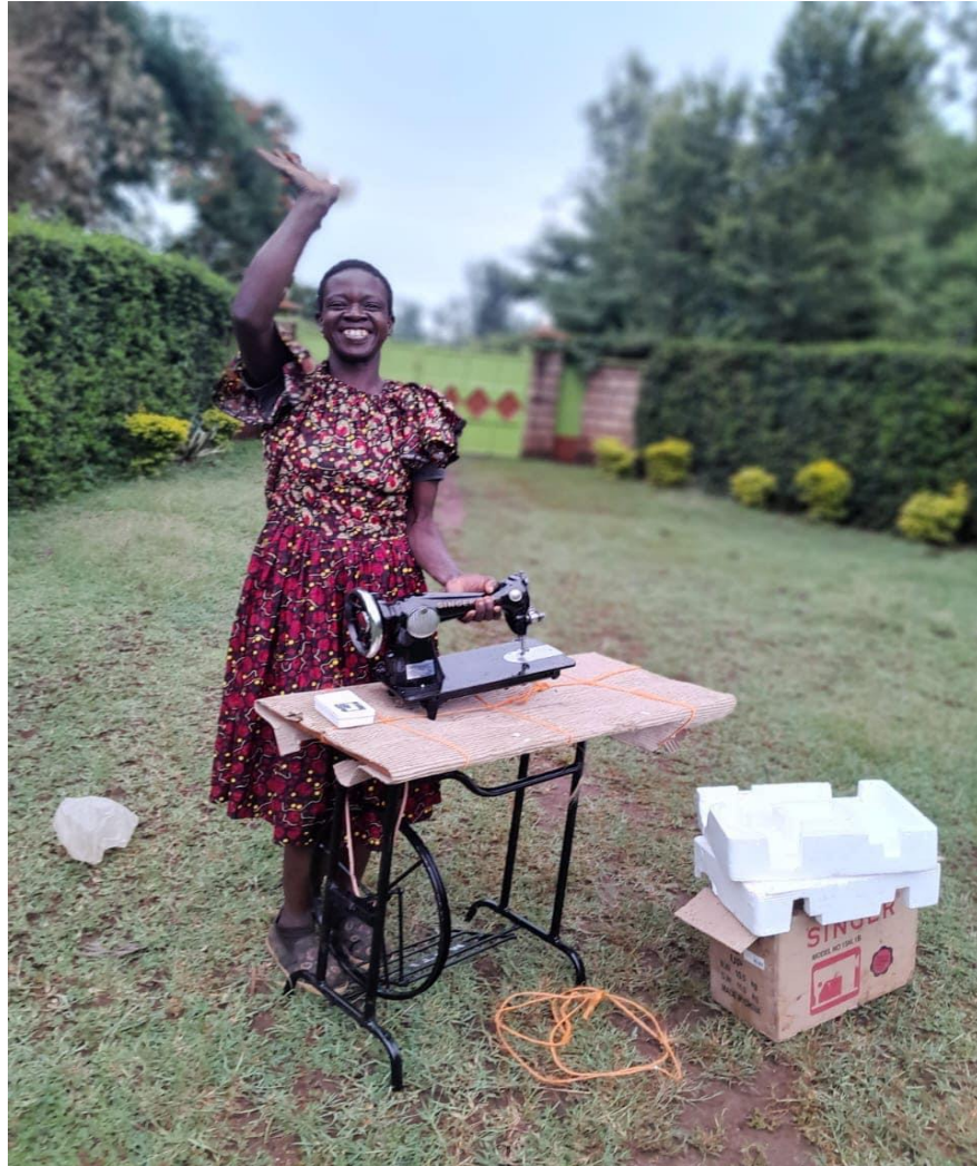
Charity - our Machaku Special Unit Graduate receives her sewing machine Contents