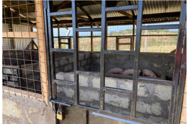
The Pig unit, funded by the Permaculture 2 grant, has several pigs which supply useful manure to the farm.

The farm labourer supported under the Permaculture 2 grant was on a years contract which expires in April 2023. His work was seen to be of a high standard and FKK have agreed to fund him for another year from our general funds