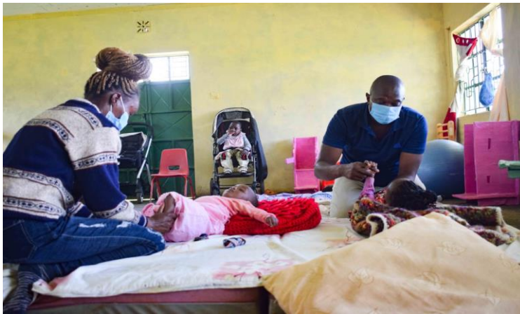
Physio work at the Rehema Centre - with pink disability aids made at the APT centre ready to be used.

Disability Fund day -this was not held again this year.