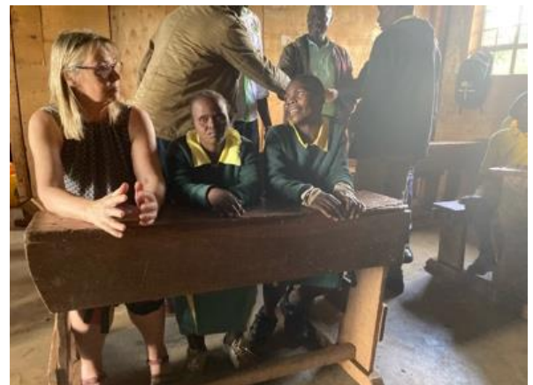
Trustee visit the Special Units meeting learners and assessing water needs