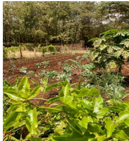
The farm showing avocado tree and greens.