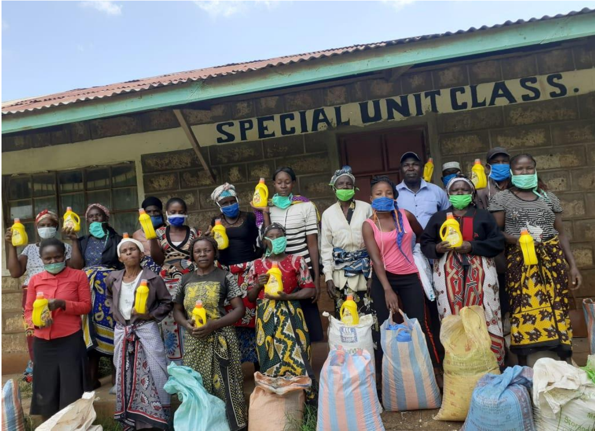
The Food Parcel Project - part of our COVID 19 Pandemic Response