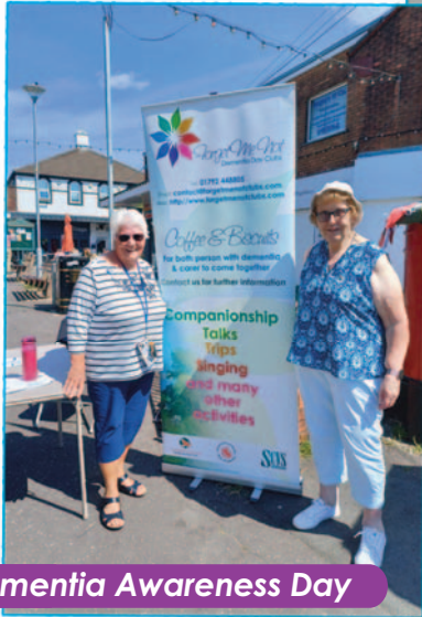
Dementia Awareness Day