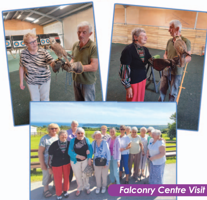
Falconry Centre Visit