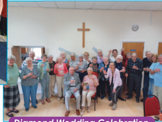
Diamond Wedding Celebration