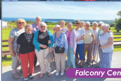
Falconry Centre Visit