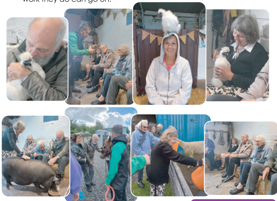
Day out at Brynteg Farm

Everything we can do to help raise the profile and status of carers, and the support that they get, will help ensure that the amazing work they do can go on.