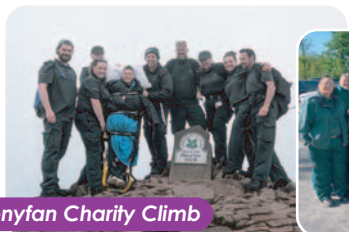
Penyfan Charity Climb