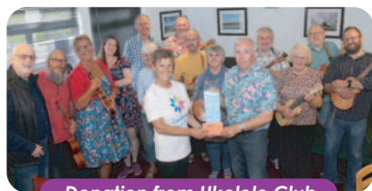
Donation from Ukelele Club