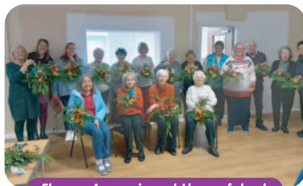
Flower Arranging at Llanyfelach