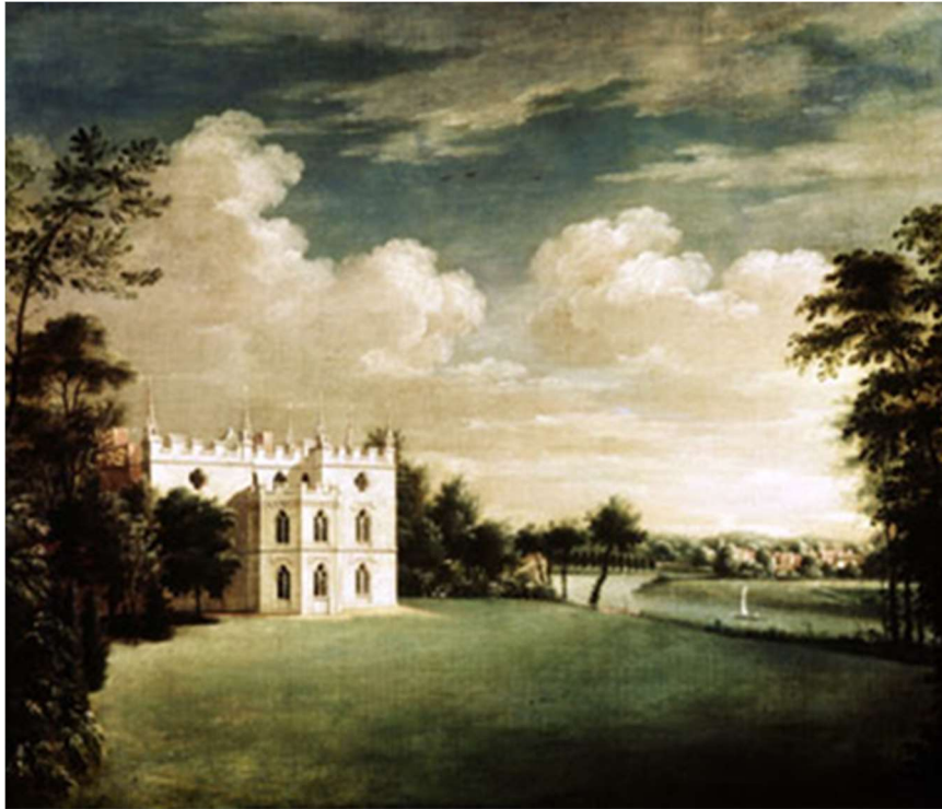
South view of Strawberry Hill by Johann Heinrich Muntz 1758