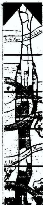
Lanes of Reflection

The 2022 competition was for the design of a window to be installed in the Parish Church at Dunsden Green in South Oxfordshire to celebrate the time that Wilfred Owen, the First World War poet, spent in the village and its church prior to going to war. The Competition was won by Caroline Small with her design Lanes of Reflection . The congregation at the church chose Transformation by Natasha Redina as the design to be commissioned.