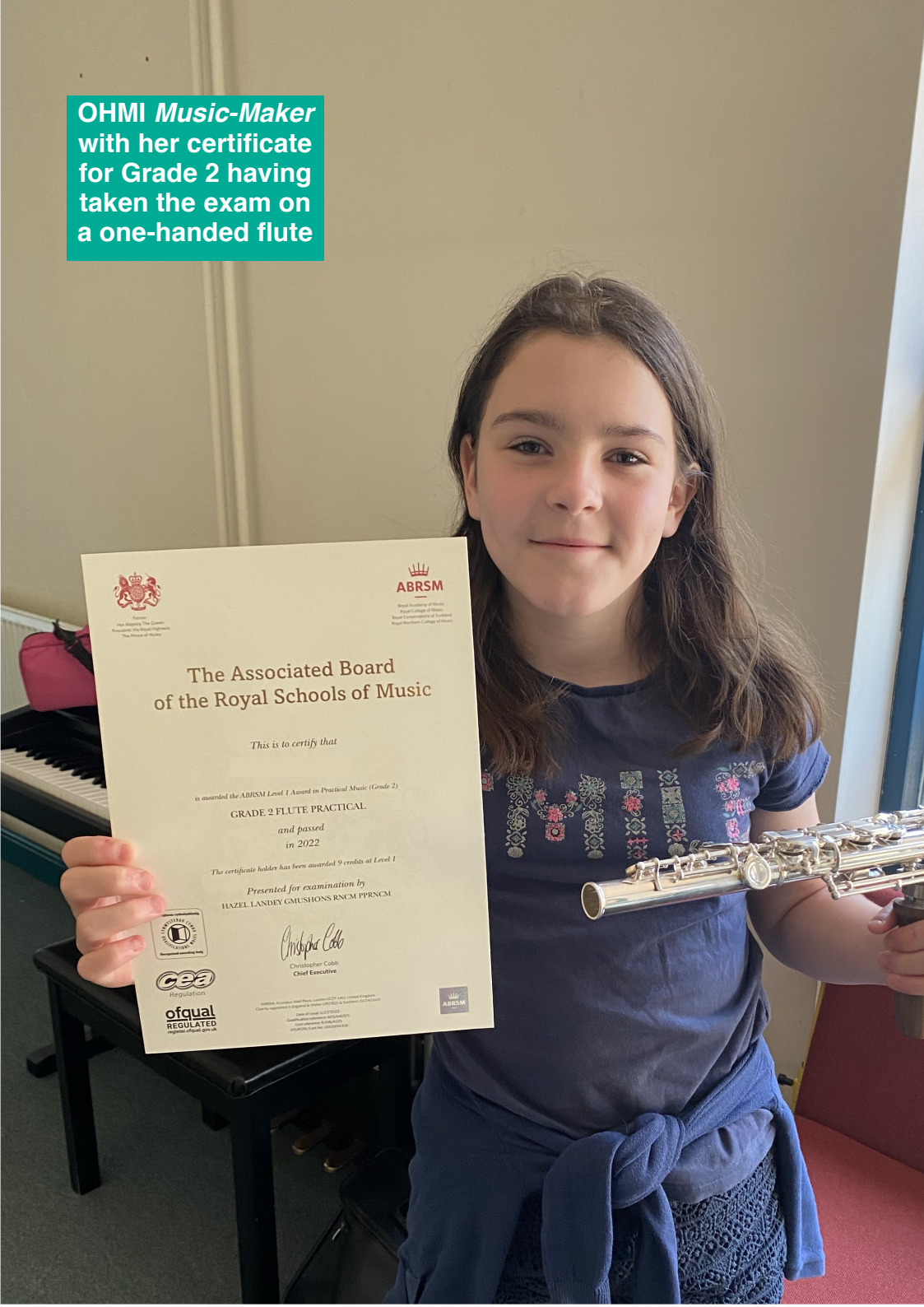
OHMI Music-Maker with her certificate for Grade 2 having taken the exam on a one-handed flute