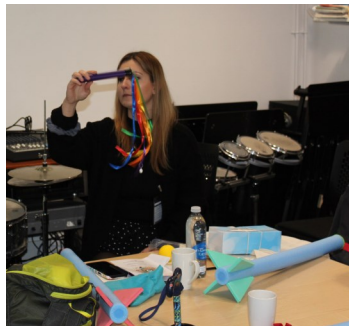
A teacher exploring the kit we use to analyse the physical needs of children.

Our individual lessons continue to expand in the variety of instruments and locations we are working in. We hope that it will become a natural progression route for students who start their musical journeys in the Whole Class programmes. We were delighted to be able to bring many of our individual Music-Makers together for an ensemble day in Hereford. It was great for each of them to meet others who played similar instruments!