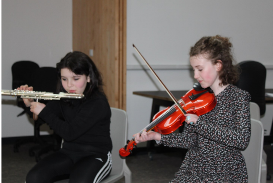
OHMI Music-Makers performing together at an ensemble day in Herefordshire