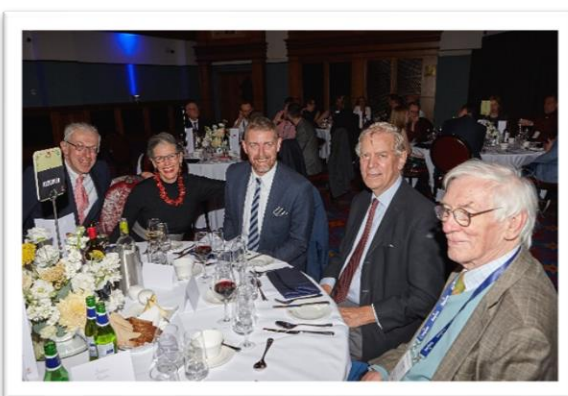
Attendees at the 2021 Annual Conference Gala Dinner