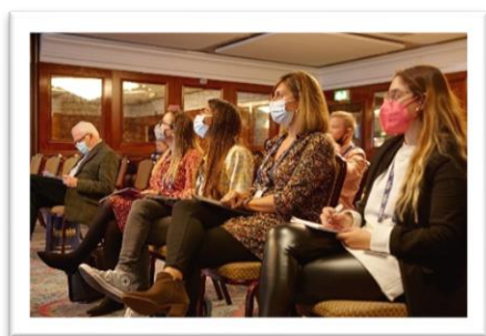
Attendees at the 2021 Annual Conference

As a result of the Covid19 pandemic, Eaquals postponed the annual conference for 2020 and this finally took place on 21 st -23 rd October 2021 at the Europa Hotel in Belfast and was run as a hybrid event with the conference also being accessible online.