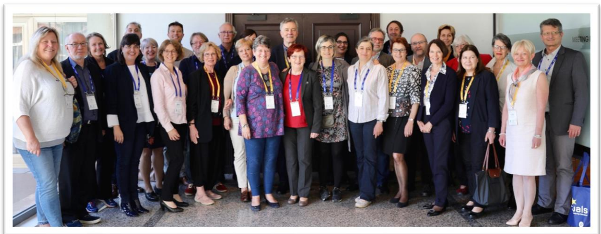
Eaquals Inspectorate at training during the annual conference in 2019.