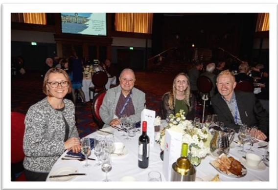
Attendees at the 2021 Annual Conference Gala Dinner