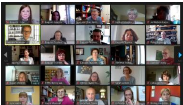
Eaquals Trustees, Staff and Members at the 2020 online AGM.