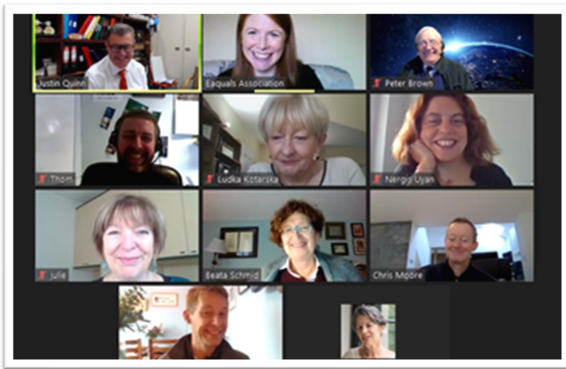
Eaquals Board of Trustees, Online Meeting, 2020.

Eaquals (Evaluation and Accreditation of Quality Language Services) was founded in 1991 as the European Association for Quality Language Services. The name was later changed to reflect Eaquals’ development at global level.