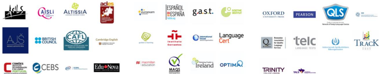
Eaquals Associate Members, 2020