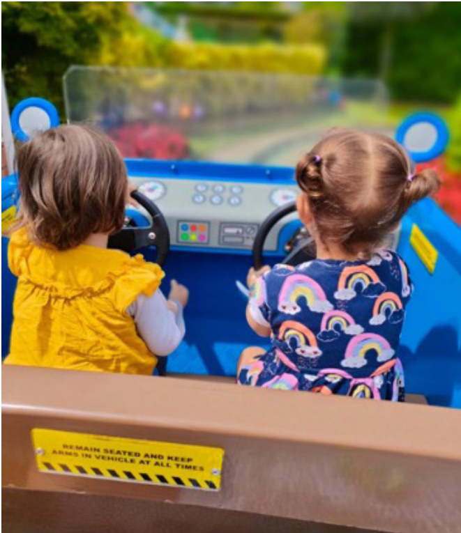
Mums & Young Children Day Out