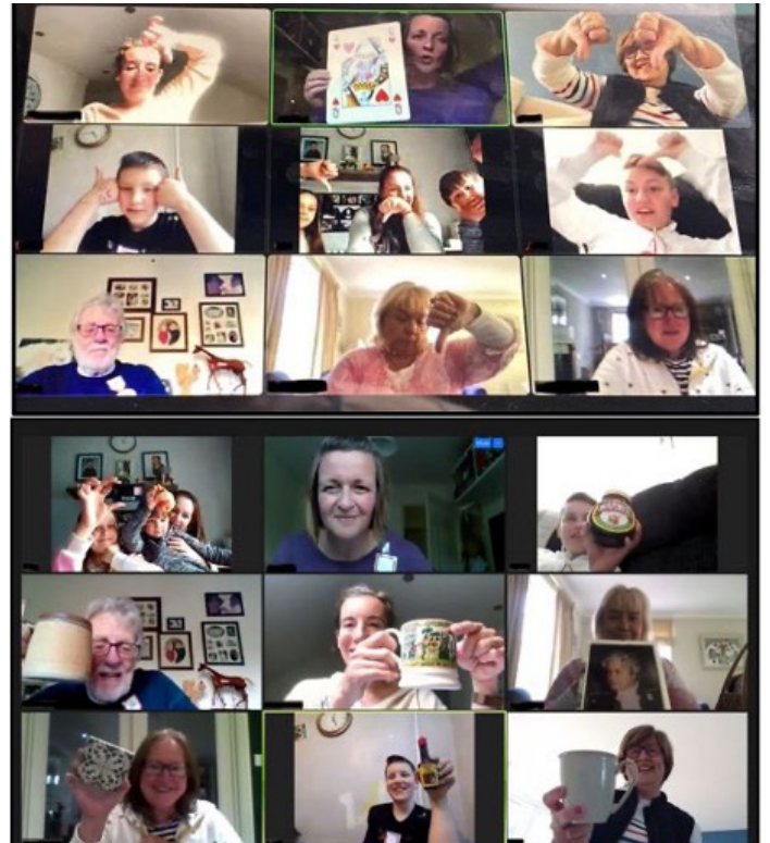
Zoom Quiz - Family Fun Fridays

"My volunteer is a very good listener. We have fun together and I can talk to her about what's on my mind"