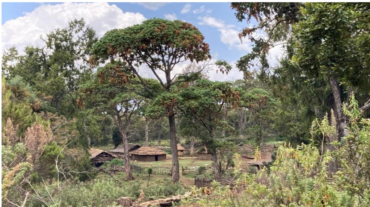
Ogiek community.