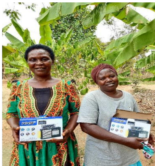
Community members receiving radios as part of the FVR programme

In this financial year, 1,939,262 seedlings were distributed in Uganda representing 63% of the annual target (3.1 million). This figure is lower than the 3.1 million target due to COVID-19 restrictions, changes in climate and staff changes at partner level. 17,278,174 seedlings have currently been distributed in the region, since 2010. This is 69% of the total target (25 million seedlings) to be distributed by 2025. In March 2022, Mount Elgon Tree Growing Enterprise Ltd (METGE) implemented the Farmers Voice Radio (FVR) programme as a means of sharing knowledge and stimulating demand for seedlings.