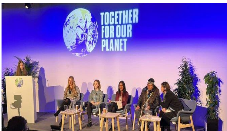
YCA organised event at COP26

The YCA have continued to go from strength to strength this year. Their first main activity was organising the online Youth Climate Summit involving chairing a panel discussion between schools and the Welsh Government Climate Change Minister. They also ran screenings of documentaries on biodiversity and campaigned to encourage youth voter registration. Through engagement with Welsh Government Ministers, the YCA now co-chair the Cross-Party Group on Climate and Wellbeing in the Welsh Parliament and attend the monthly meetings.