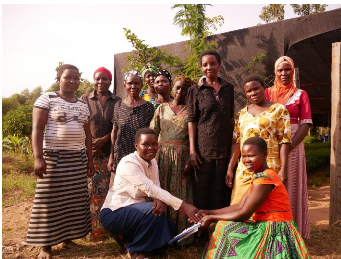
Female Tree Nursery Bed Operators, Bumaena

Size of Wales successfully applied to Hub Cymru Africa for funding to implement a Gender and Climate Justice project in Uganda with two partners - METGE and MADLACC (Masaka District Landcare Chapter), via International Tree Foundation (ITF).