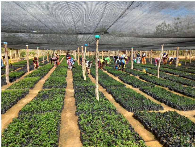
Seedlings at the Bore tree nursery

We also added a new partner, Regrow Borneo , to our project portfolio at the end of the financial year. This project seeks to restore tropical forest through ethical, transparent, and research-led replanting of tropical forest in the Lower Kinabatangan Wildlife Sanctuary, Sabah, Malaysia.