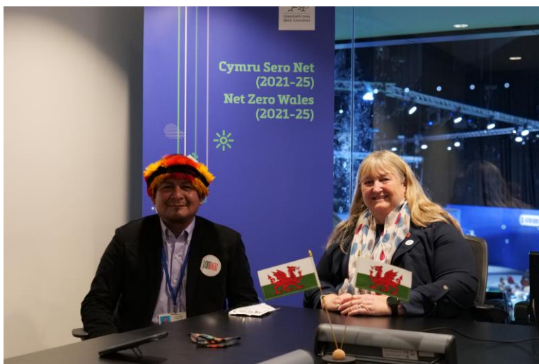
Wampís Indigenous Leader meeting Welsh Climate Change Minister

We then publicly launched the report at COP26 in Glasgow. Size of Wales is now an official observer NGO of the United Nations Framework Convention on Climate Change (UNFCCC) COP process. At this conference, we raised the voices of indigenous peoples and young people from Wales. Using these voices, we organised a series of meetings with Welsh Government, delivered over eight talks and were featured on media numerous times.