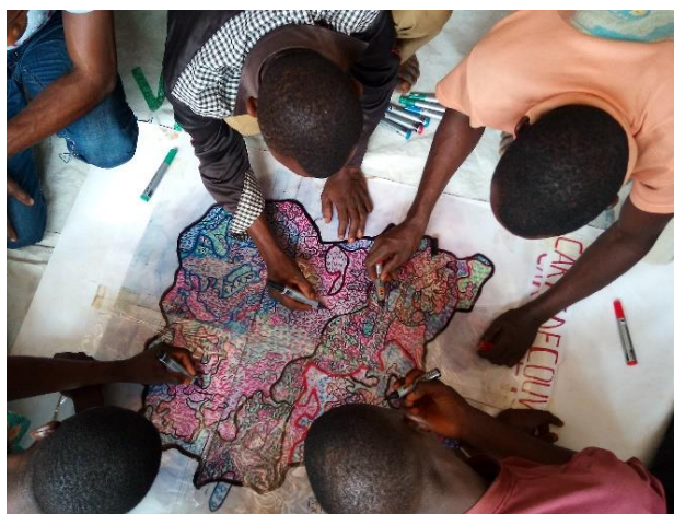
Participatory mapping with the community

Rates of deforestation in DRC are some of the highest in the world. But, in areas where local communities manage the land, these rates are significantly lower. This project aims to achieve a long-term decrease in deforestation by tracking and collating data from community-managed forests and to gain a better understanding of how this model can be improved and expanded throughout the Congo Basin. This project seeks to contribute to improving the livelihoods and overall wellbeing of forest communities while preserving the ecological integrity of the Congo Basin rainforest.