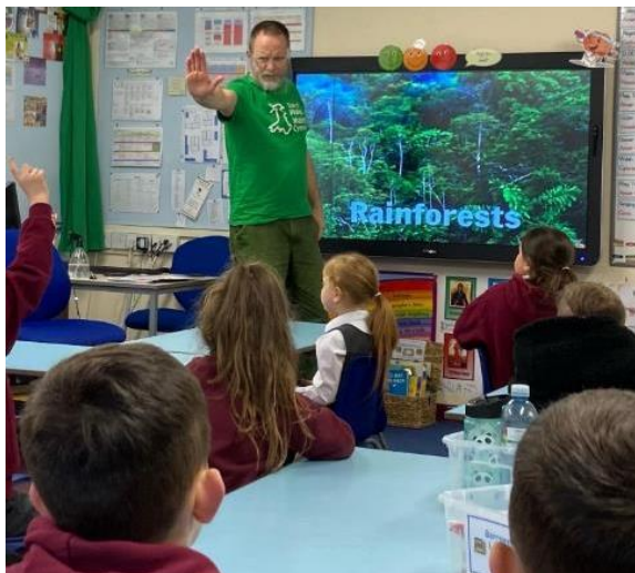
Workshop at St Therese Primary School

In addition, Size of Wales also delivered a session as part of Keep Wales Tidy eco week to over 80 classrooms and over 1,000 children on deforestation and its links to climate change.