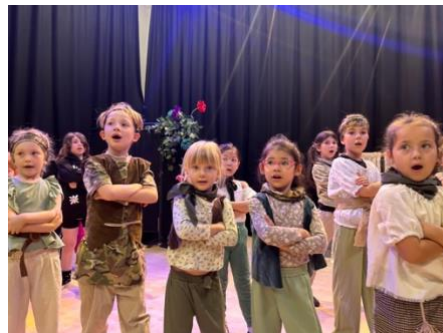
Summer 2024 - Summer 'Peter Pan' Musical Performance

The summer production this year was our own musical theatre version of the 'Peter Pan' story. It was performed at Heartlands High School, in their drama studio. As the students were familiar with the original story, they had lots of their own ideas to add into the production.