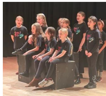
Winter 2024 - Student end of year showcase and annual awards presentation.

In December we presented the students end of year showcase, once again at Heartlands High School. The current students were presented with various awards recognising 'most improved' in each class, and other awards including our annual 'The Power Cup' and 'Rising Star' Award.