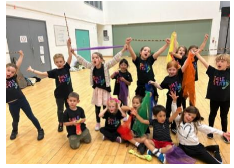
Spring 2024 - Starpower Dance Competition & A in class Circus skills workshop.

The Starlet street dance team won 1st place in their group, 2nd place overall high score award in their age division. Plus, an invitation/scholarship for Battle On The Seas cruise!