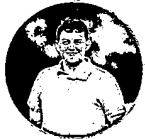
OUTREACH WORKER 0.6 FTE