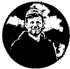
OUTREACH MINISTER Full Time – new role from March 2024