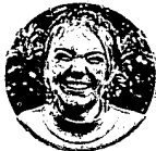
DIGITAL ASSI STANT 0.2 FTE