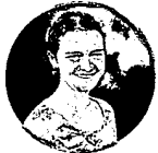
PASTORAL MI NISTER Full time