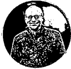
ADMINISTRATOR 0.5 FTE