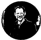
DEVELOPMENT MI NISTER 0.4 FTE