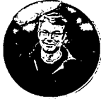
OPERATIONS MA NAGER Full time (as of June 2023)