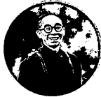
YOUTH WORKER 0.6 FTE