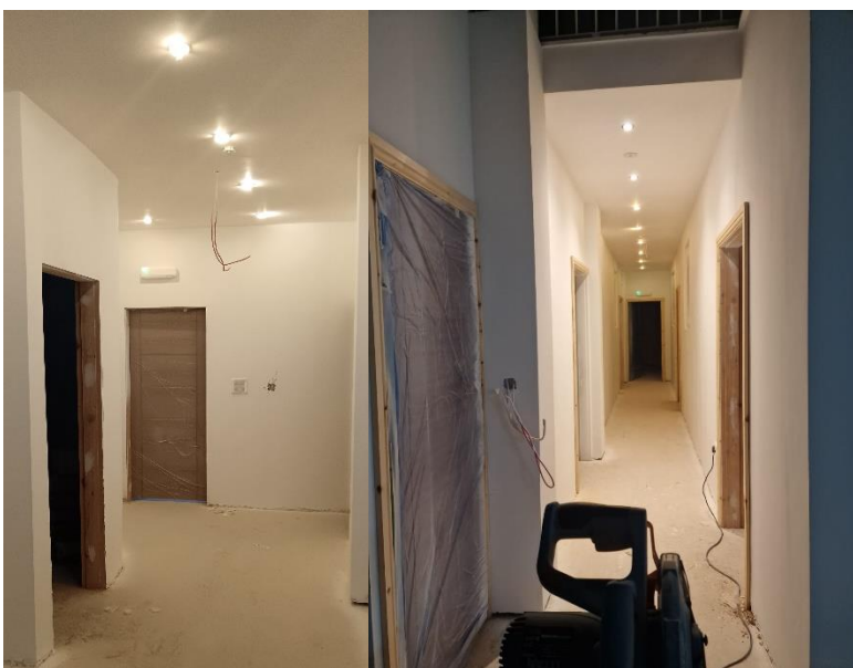
The image above shows the first floor classrooms & hallways painted and decorated.