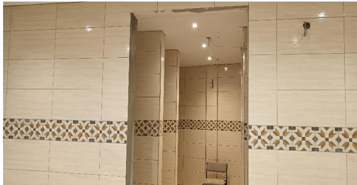
The image above shows the first floor wudu khana & toilet walls tiled and spot lights fitted.