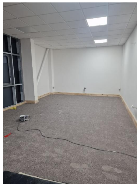
The image above shows the first floor conference rooms suspended ceiling fitted.