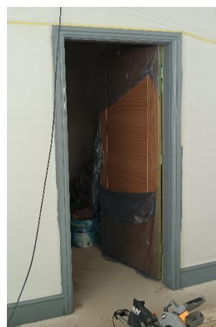
The Image on the right shows the classroom doors, architrave & skirting boards fitted.