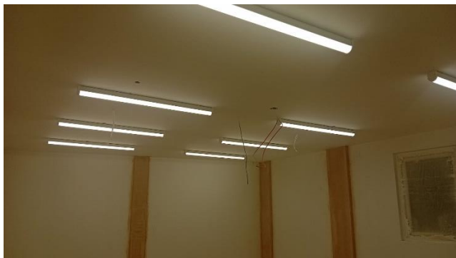
The image above shows the lights fitted in a classroom.