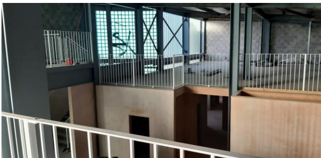
The image shows the painted steel pillars on the first floor.