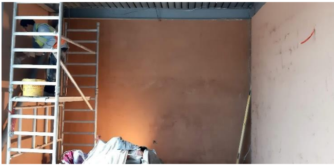
The image above shows the plastering of the first floor classrooms.

The images below illustrate the progress on the new Mosque in the reporting year.