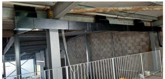
The image shows the newly fitted Gutter on the first floor.