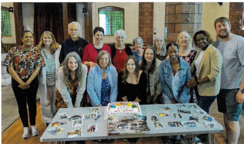
Some of the team celebrating 35 years of image at a Team Away Day