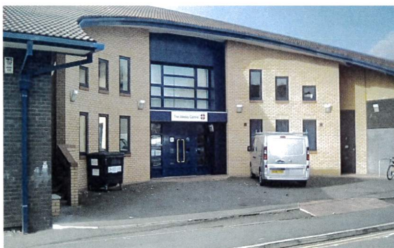
image works from rented offices at Wesley Centre, Royce Road, Hulme, Manchester, M15 5BP