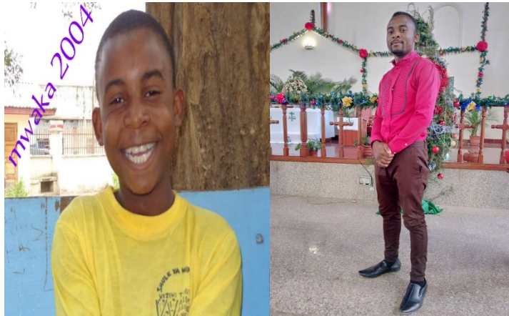
Left; During primary school. Centre; After completing f4 at Viziwi Njombe 2020. Right; Our first university graduate, class of 2020 from Mkwawa University College of Education

Health; TLC has been very successful in implementing appropriate measures to protect children against Covid 19 through distributing face masks to children from grade 4 and all TLC staff, ensuring children, visitors and all staff wash hands regularly and use sanitizers.