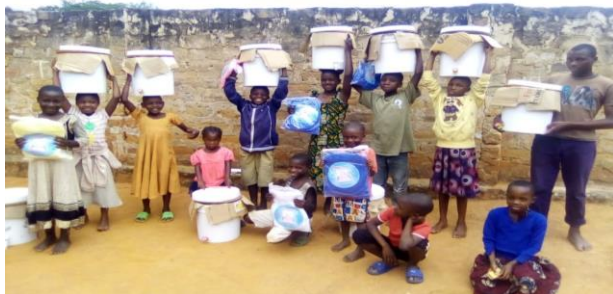
Left; Ng'ambo children after receiving water filters and mosquito nets, water filters help them and their families drink safe water and supplying mosquito nets has at least reduced the rate of Malaria infection.